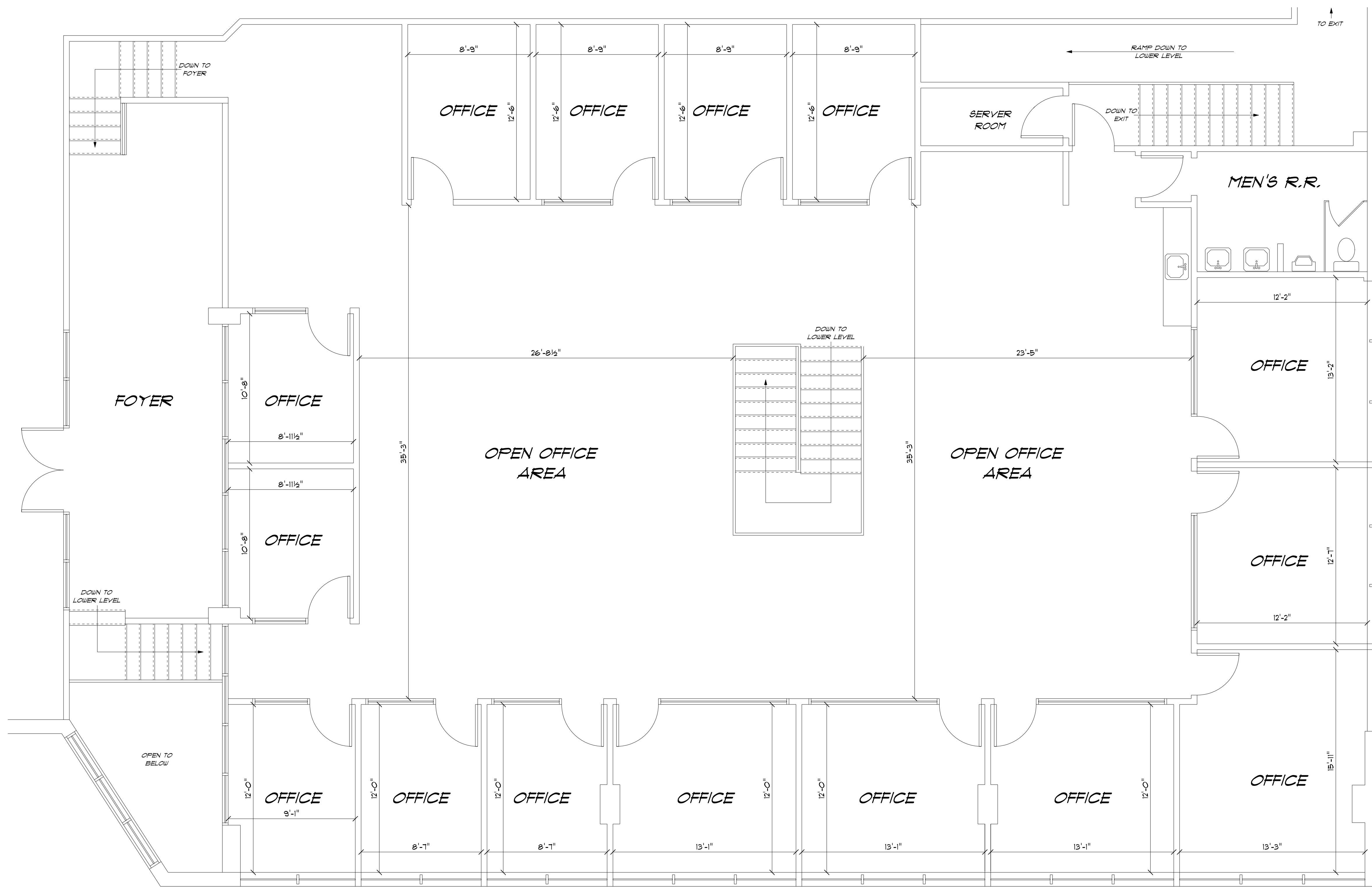
EXISTING 1st FLOOR PLAN SCALE: 1/4" = 1'-0"

... PLEASE READ ... SEE YOUR LOCAL BUILDING INSPECTOR FOR ANY ADDITIONAL MATERIALS OR PRACTICES WHICH MAY BE REQUIRED FOR YOUR LOCATION.