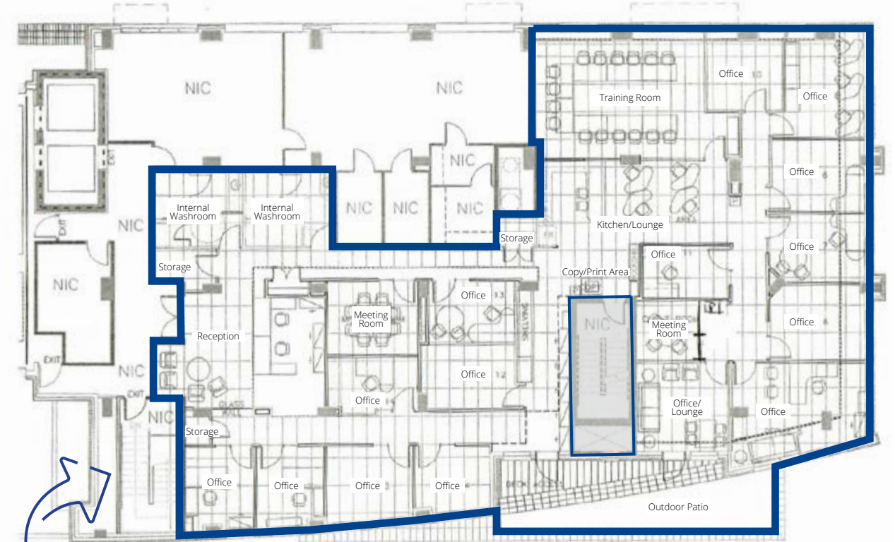
Exclusive entrance off 10 th Street with exterior signage