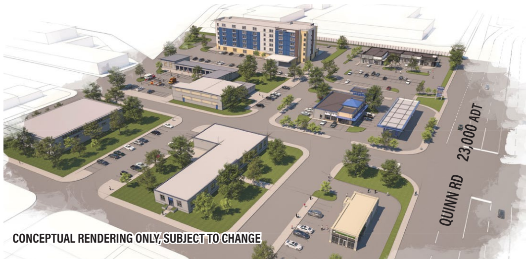
CONCEPTUAL RENDERING ONLY, SUBJECT TO CHANGE