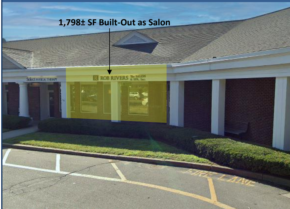
1,798± SF Built-Out as Salon

Ranked in Top 50 Commercial Firms in U.S.