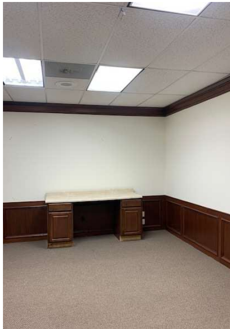
F2 - 2nd Floor