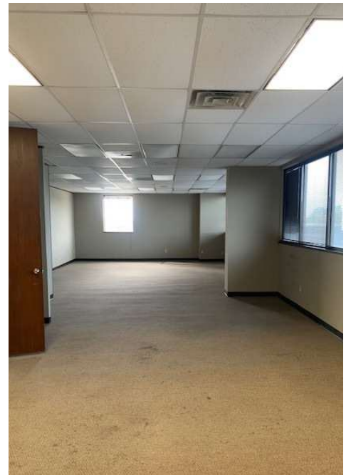
F2 - 2nd Floor

LYNANN PINKHAM 361.288.3102 lynann@craveyrealstate.com