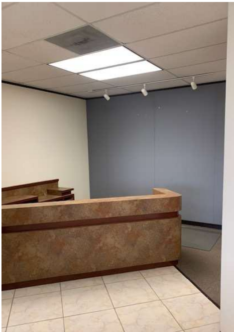
F2 - 2nd Floor