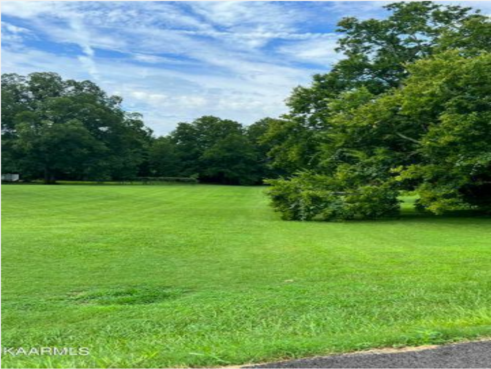
Crescent image 3