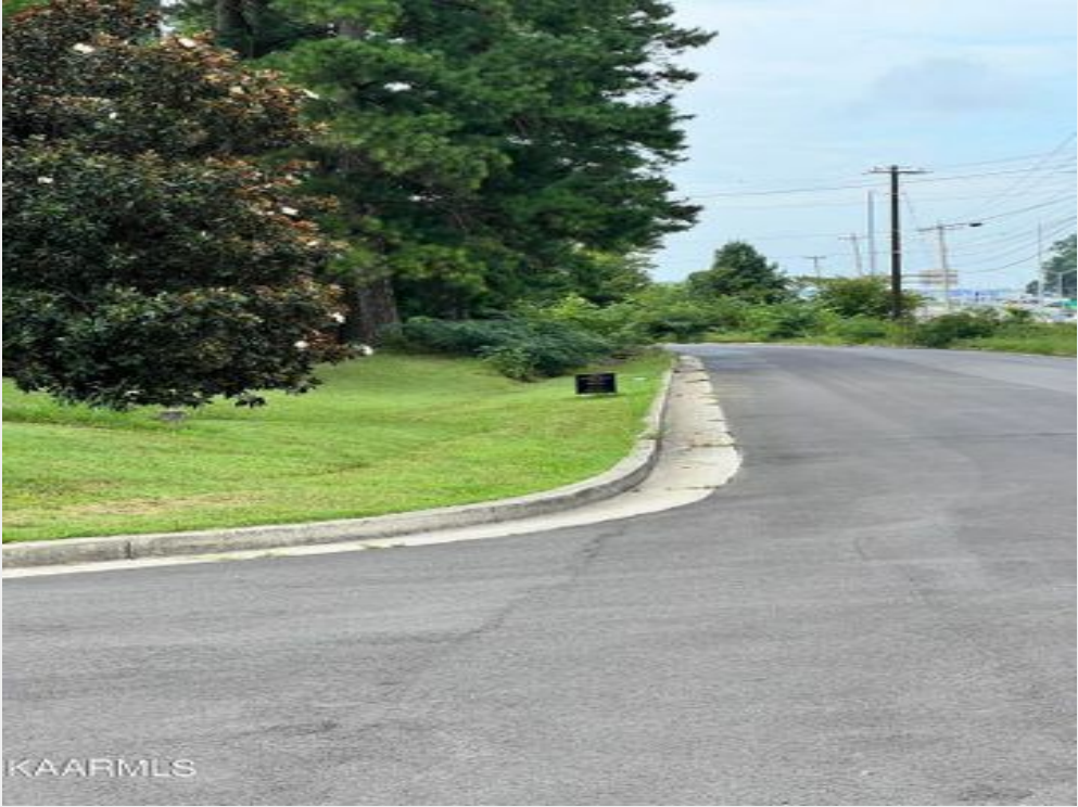
crescent image 4