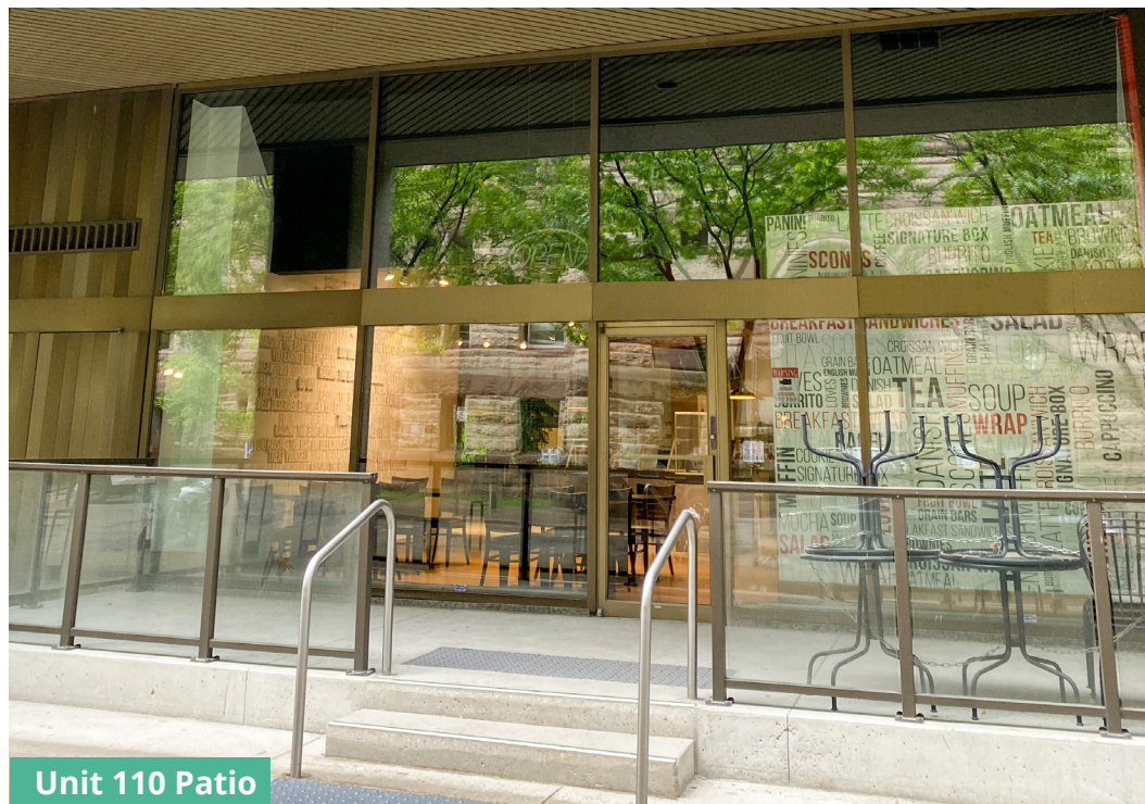
Unit 110 Patio