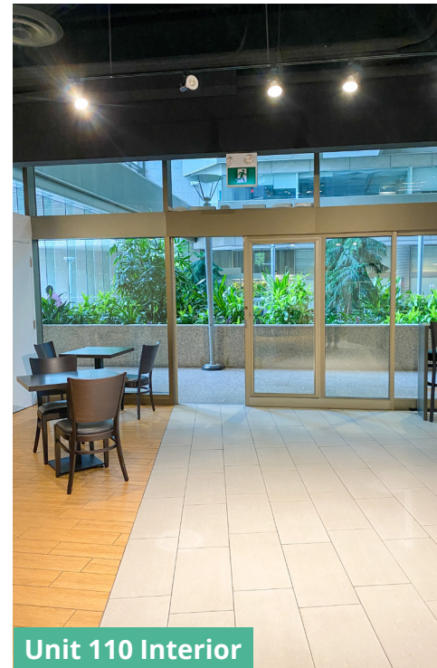
Unit 110 Interior