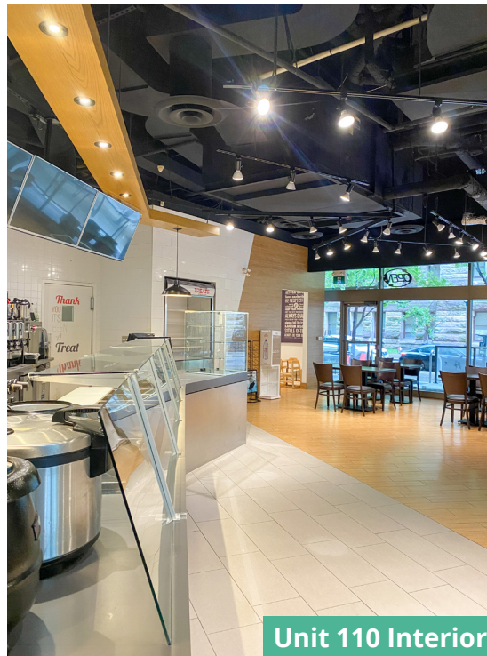
Unit 110 Interior