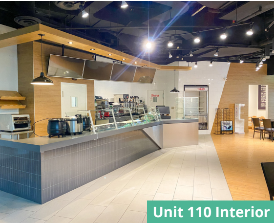
Unit 110 Interior