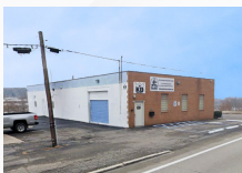
WAREHOUSE ±3,600 SF