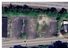
LAYDOWN YARD/PARKING ±0.5 AC