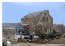
OCCUPIED RESIDENTIAL UNIT 912 SF