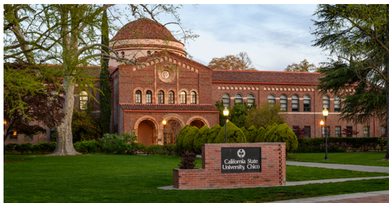
Pictured: CSU Chico, Bidwell Park, Sierra Nevada Brewery