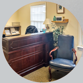
DESIRABLE 2ND FLOOR CONDO