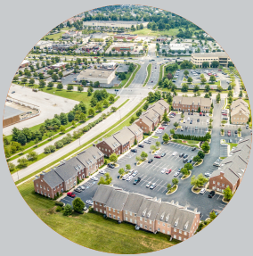
PRIME HAMBURG LOCATION