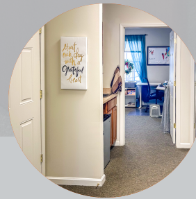
3 OFFICES, CONF, KITCHENETTE