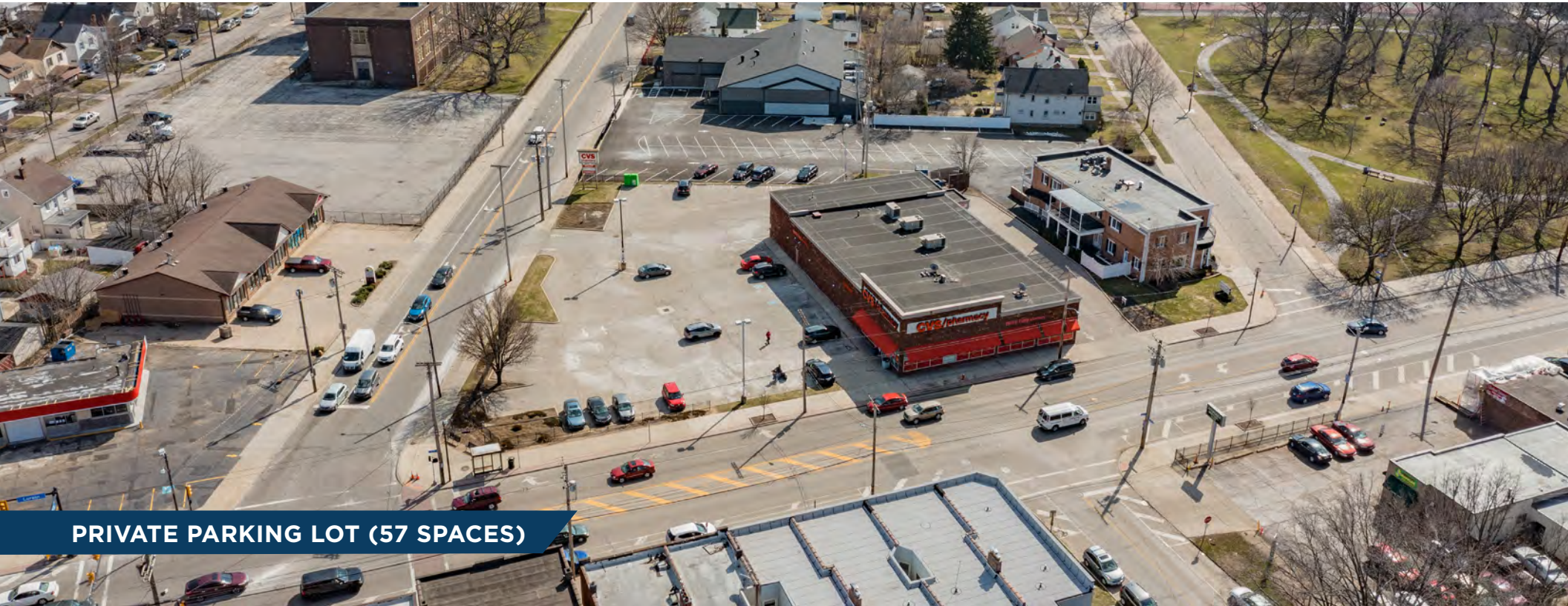
PRIVATE PARKING LOT (57 SPACES)