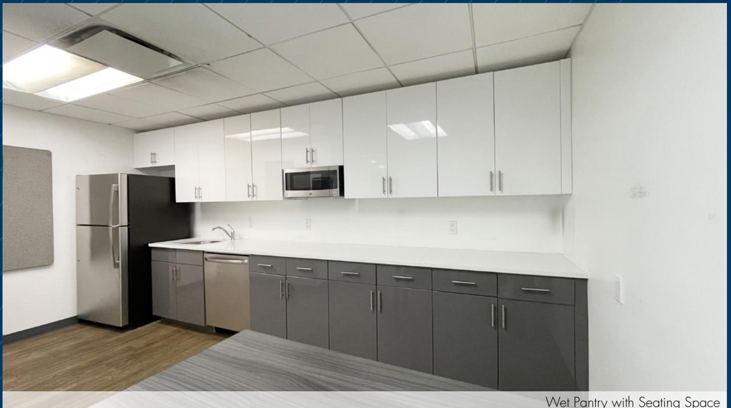
Wet Pantry with Seating Space