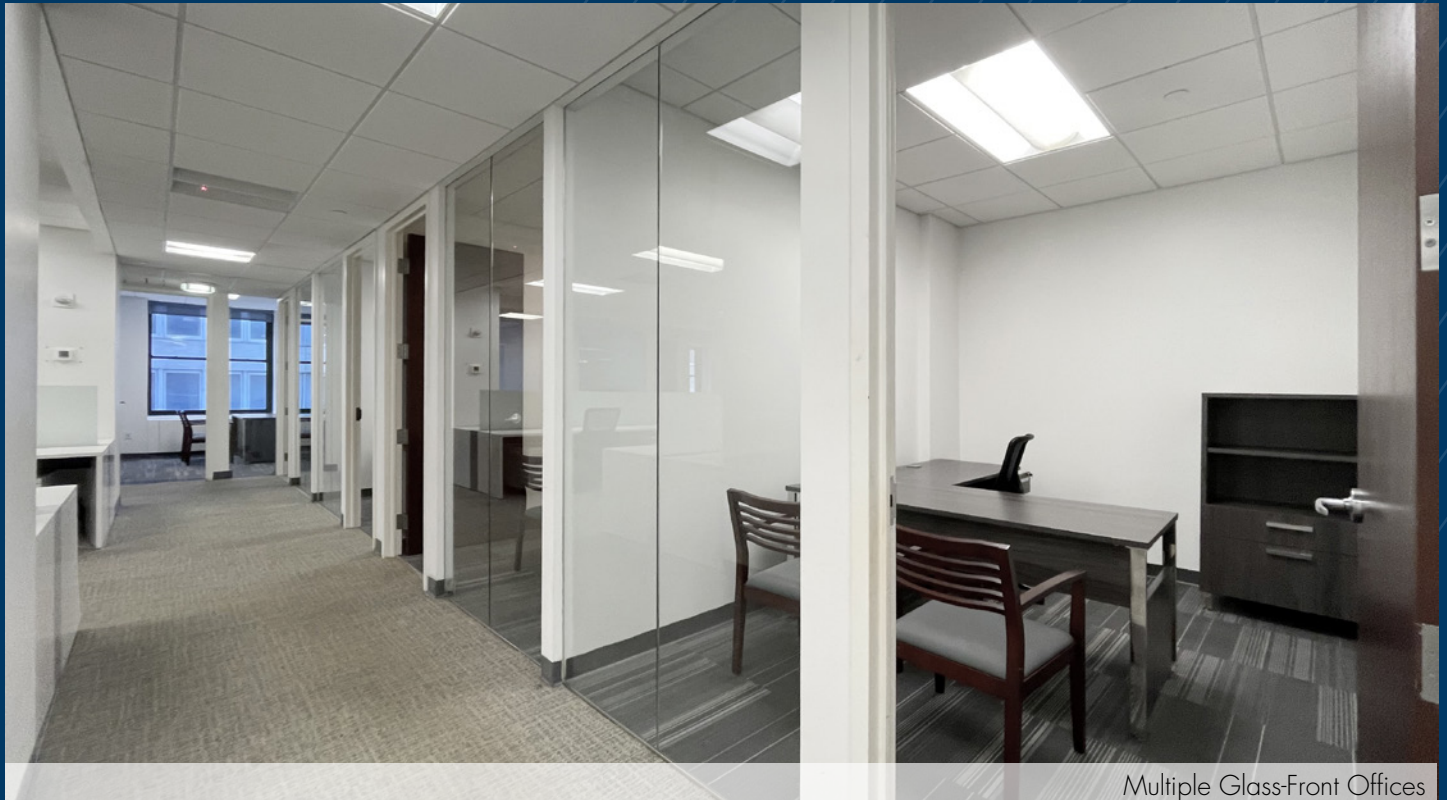
Multiple Glass-Front Offices