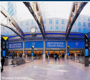
Moynihan Train Hall