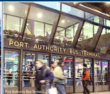
Port Authority Bus Terminal

For further information and/or inspection, please contact: