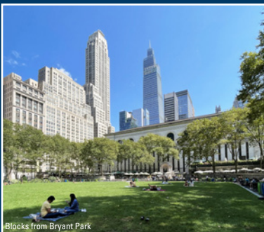
Blocks from Bryant Park