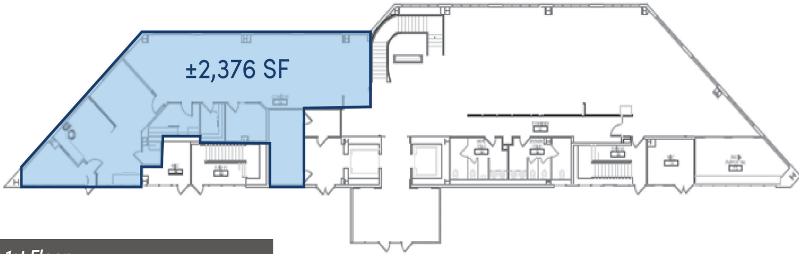
1st Floor \pm 2,376 SF