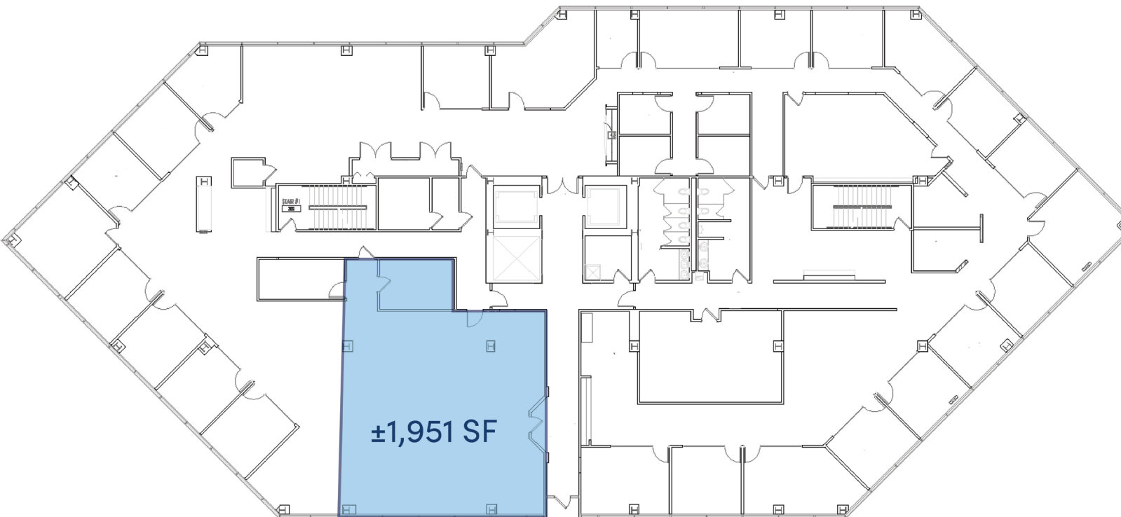
3rd Floor \pm 1,951 SF