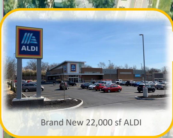
Brand New 22,000 sf ALDI