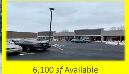
6,100 sf Available