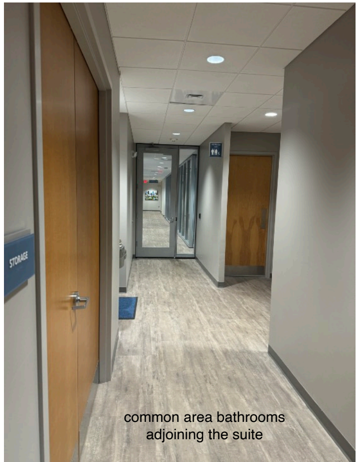
common area bathrooms adjoining the suite