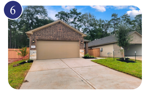
2022 West Darlington Oak Court Conroe, Texas