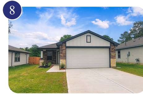
11732 Whirlaway Drive Willis, Texas