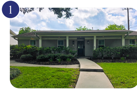
1007 Blue Willow Drive Houston, Texas