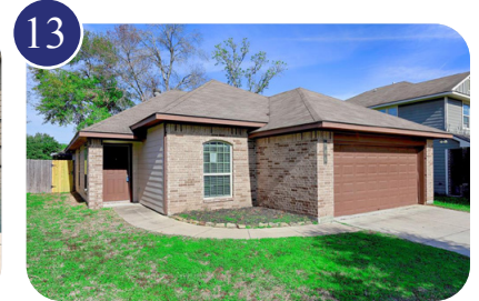
946 Oak Falls Drive Willis, Texas