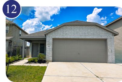
1542 San Sebastian Drive Conroe, Texas