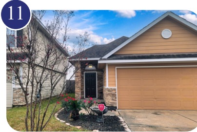
8935 Windfern Trace Drive Houston, Texas