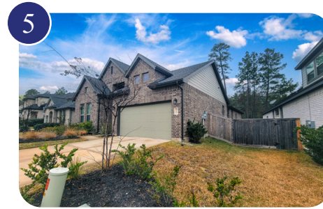
227 Rose Gum Court Willis, Texas