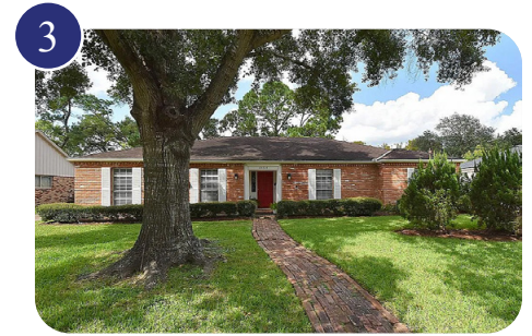
10714 Del Monte Drive Houston, Texas