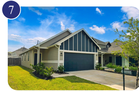
14042 Chinook Drive Conroe, Texas