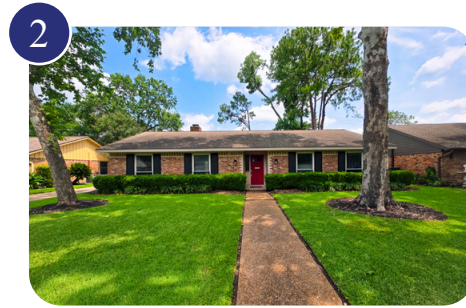
10706 Inwood Drive Houston, Texas