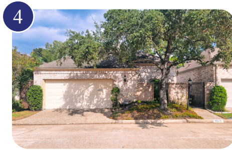
9570 Doliver Drive Houston, Texas