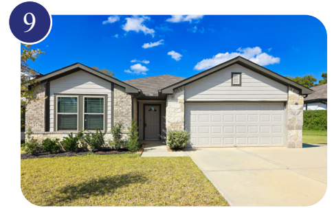
11736 Whirlaway Drive Willis, Texas