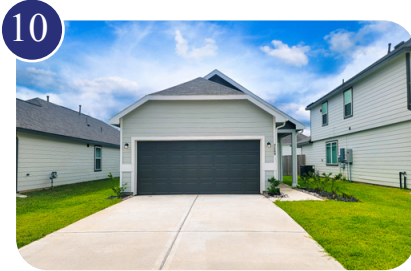
2469 Carp Drive Conroe, Texas