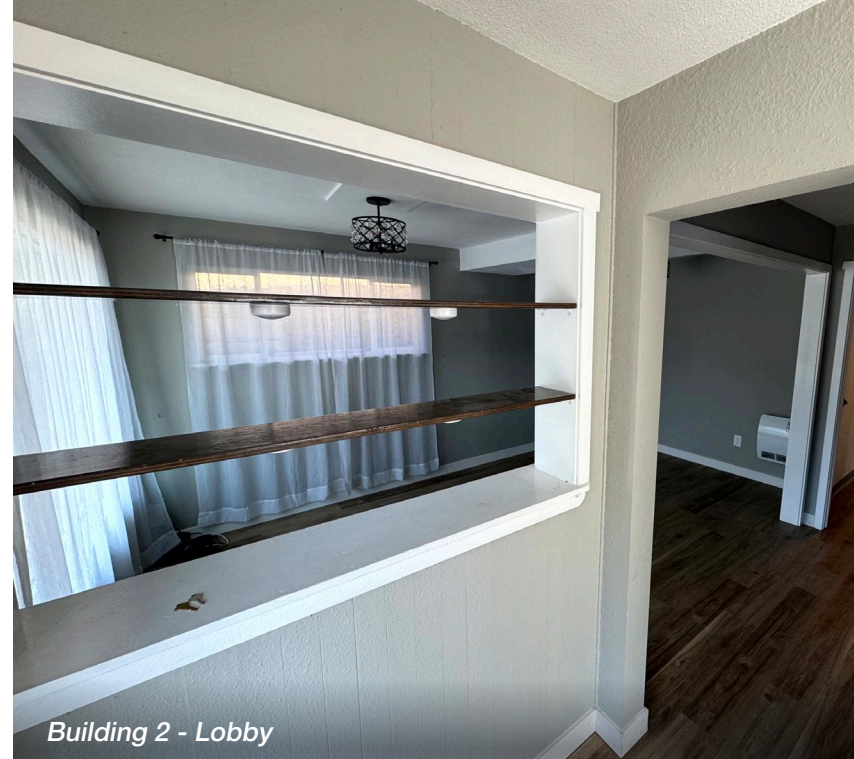
Building 2 - Lobby