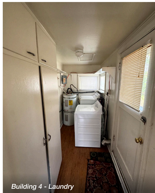
Building 4 - Laundry