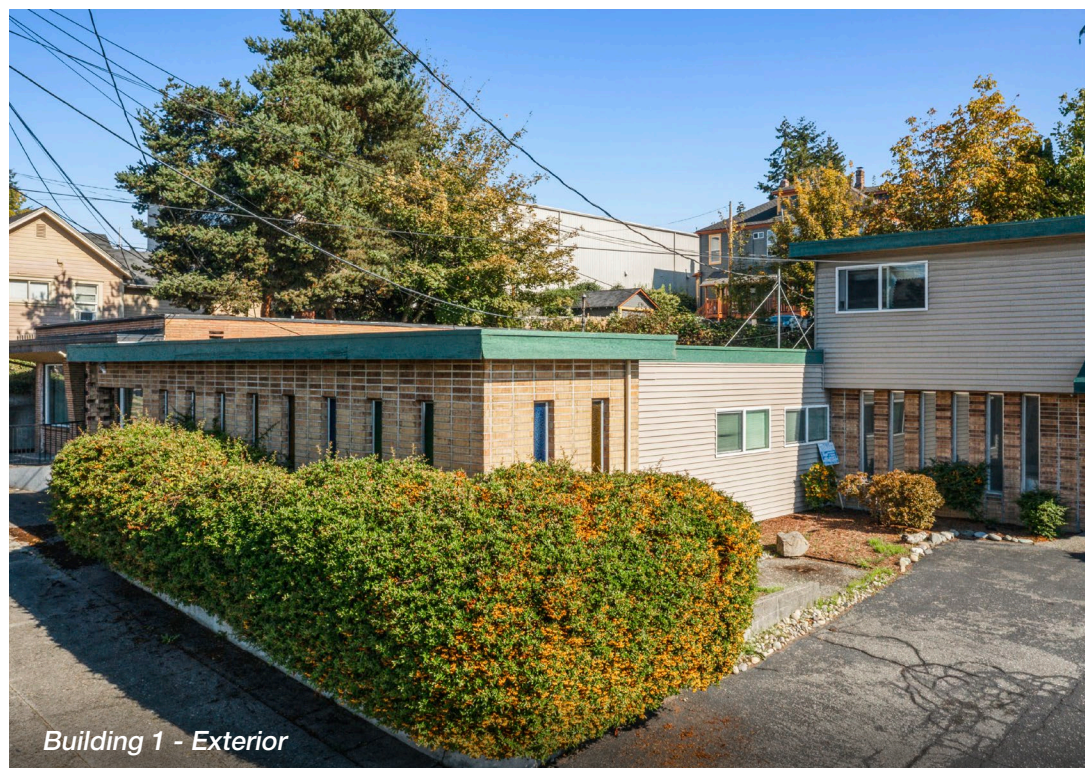
Building 1 - Exterior