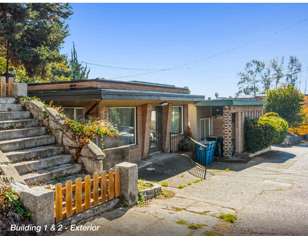
Building 1 & 2 - Exterior