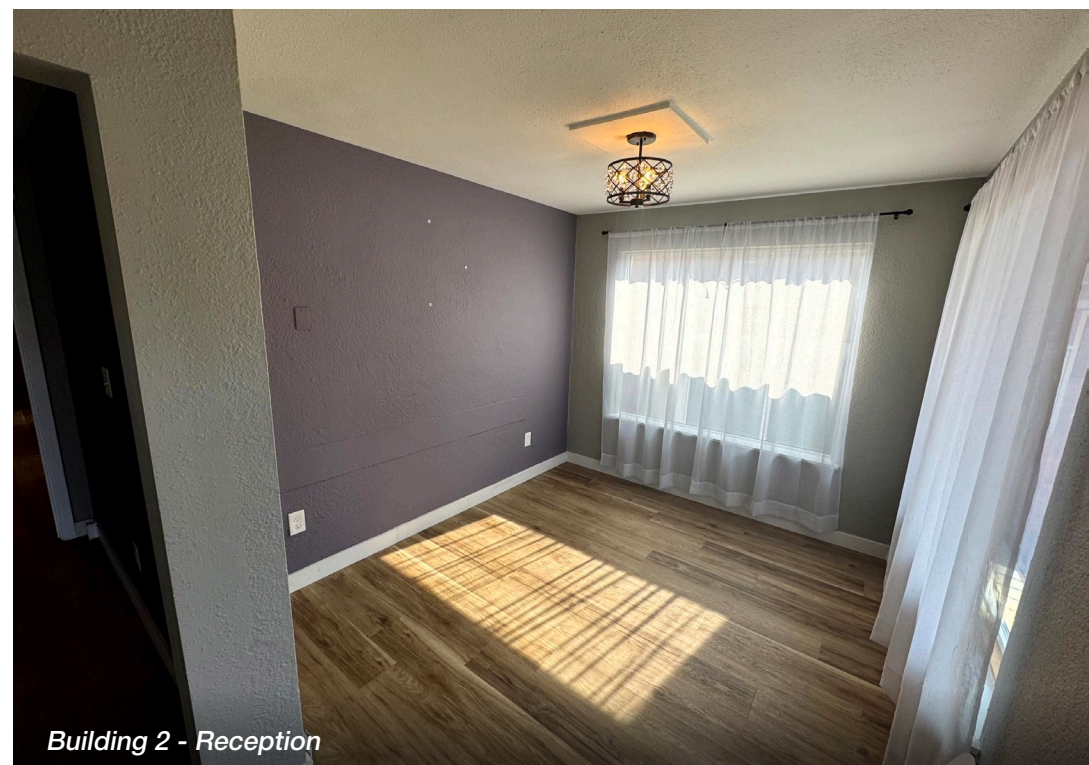
Building 2 - Reception