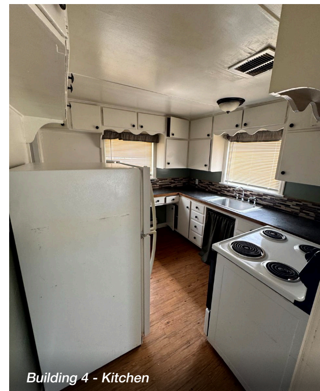
Building 4 - Kitchen