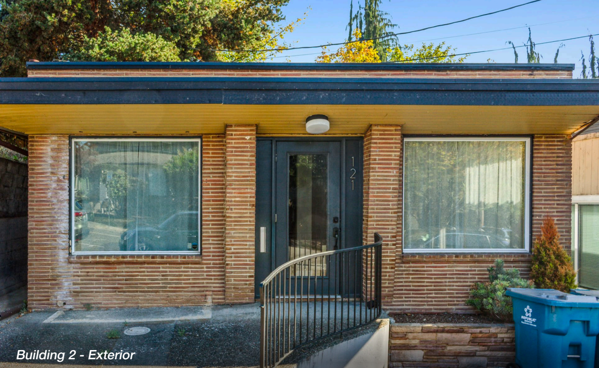
Building 2 - Exterior