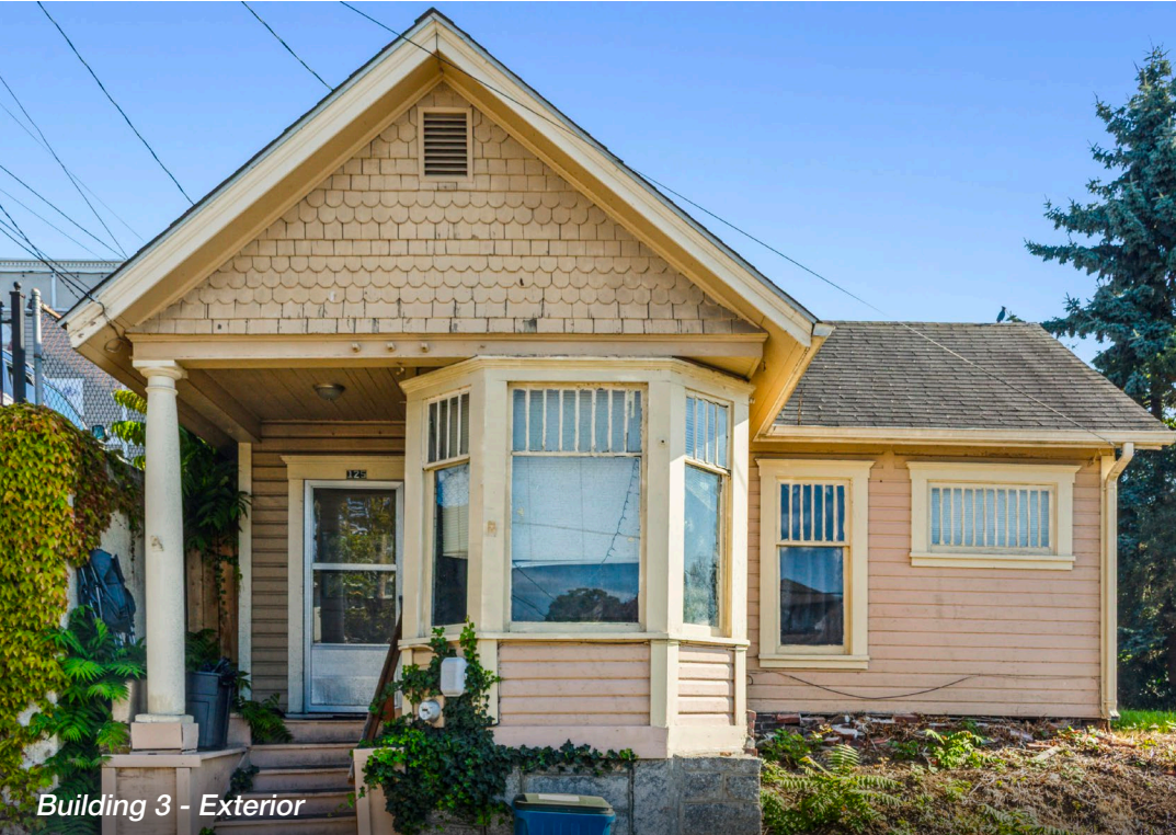
Building 3 - Exterior