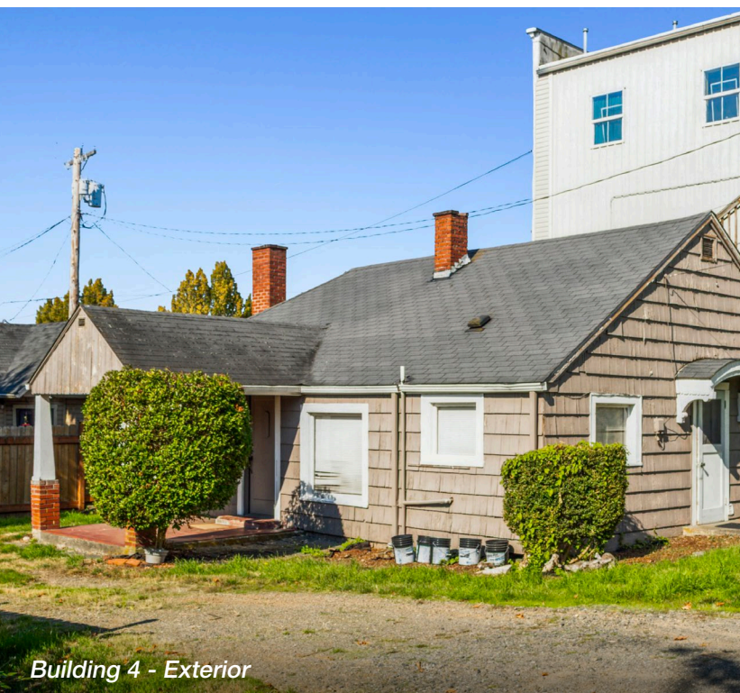
Building 4 - Exterior