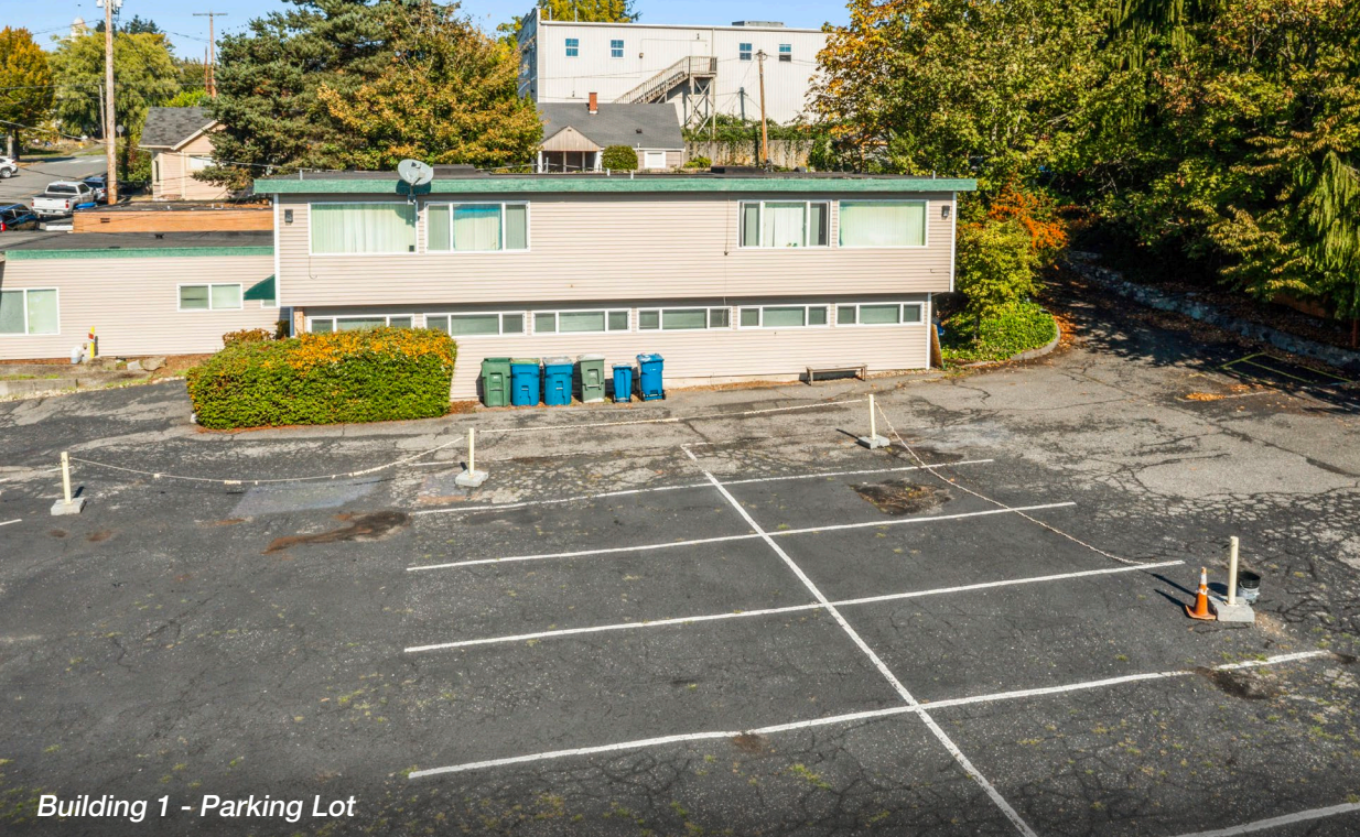
Building 1 - Parking Lot