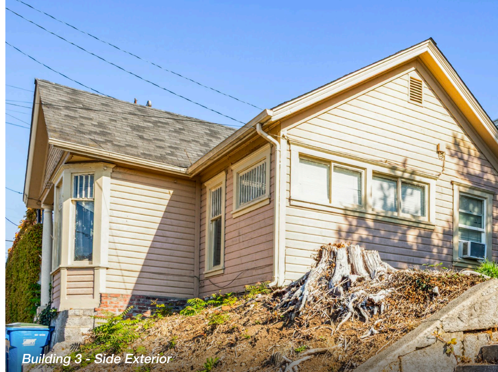
Building 3 - Side Exterior