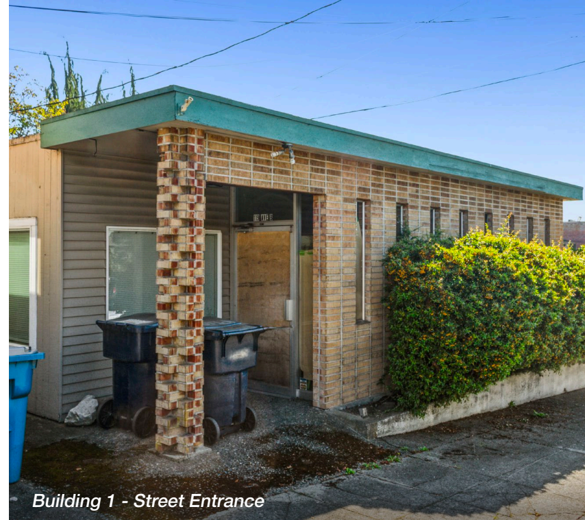
Building 1 - Street Entrance