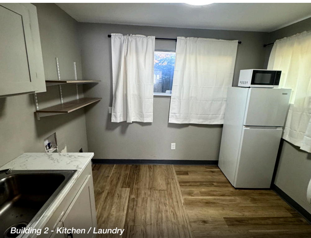
Building 2 - Kitchen / Laundry