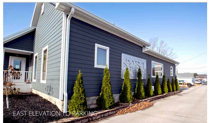
EAST ELEVATION TO PARKING