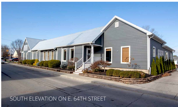
SOUTH ELEVATION ON E. 64TH STREET