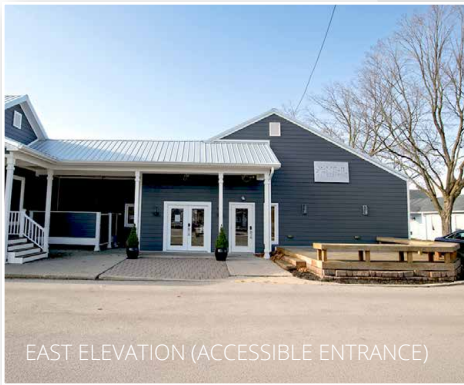
EAST ELEVATION (ACCESSIBLE ENTRANCE)