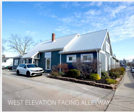
WEST ELEVATION FACING ALLEYWAY