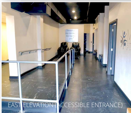
EAST ELEVATION (ACCESSIBLE ENTRANCE)