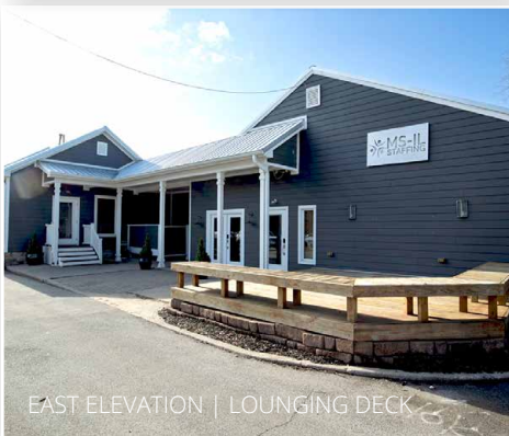
EAST ELEVATION | LOUNGING DECK