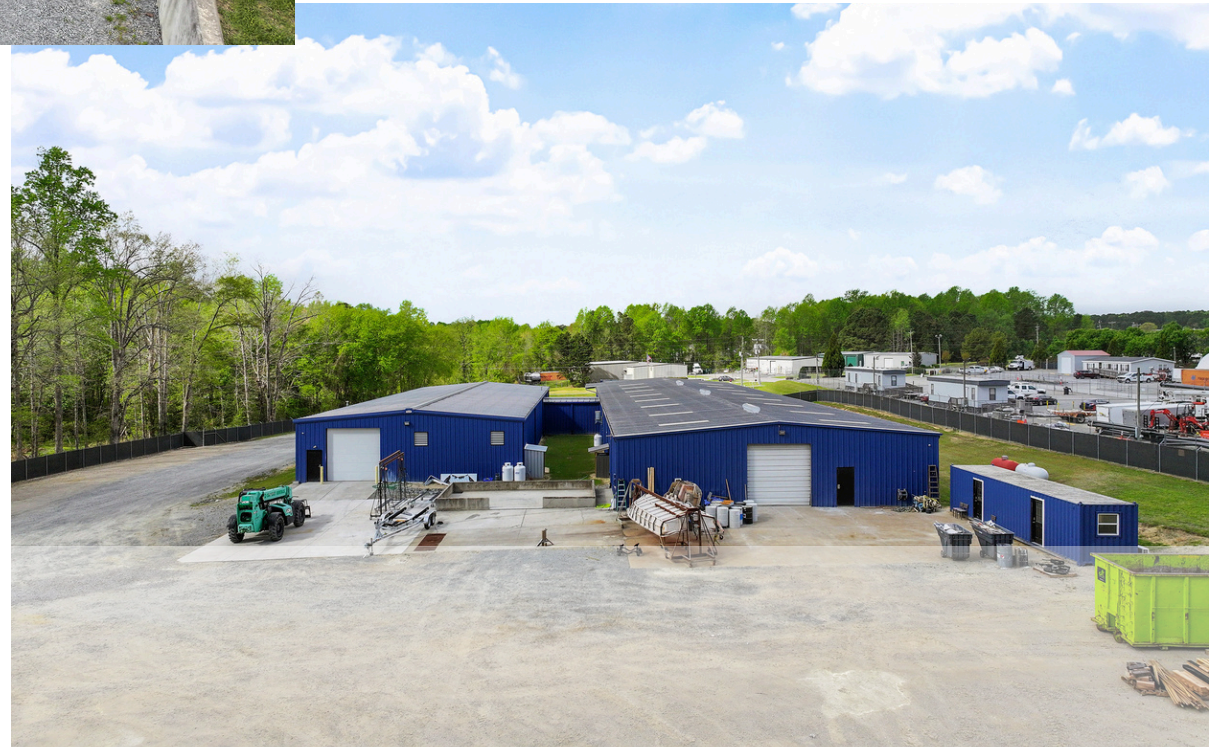
Drive-In Doors & Yard Space