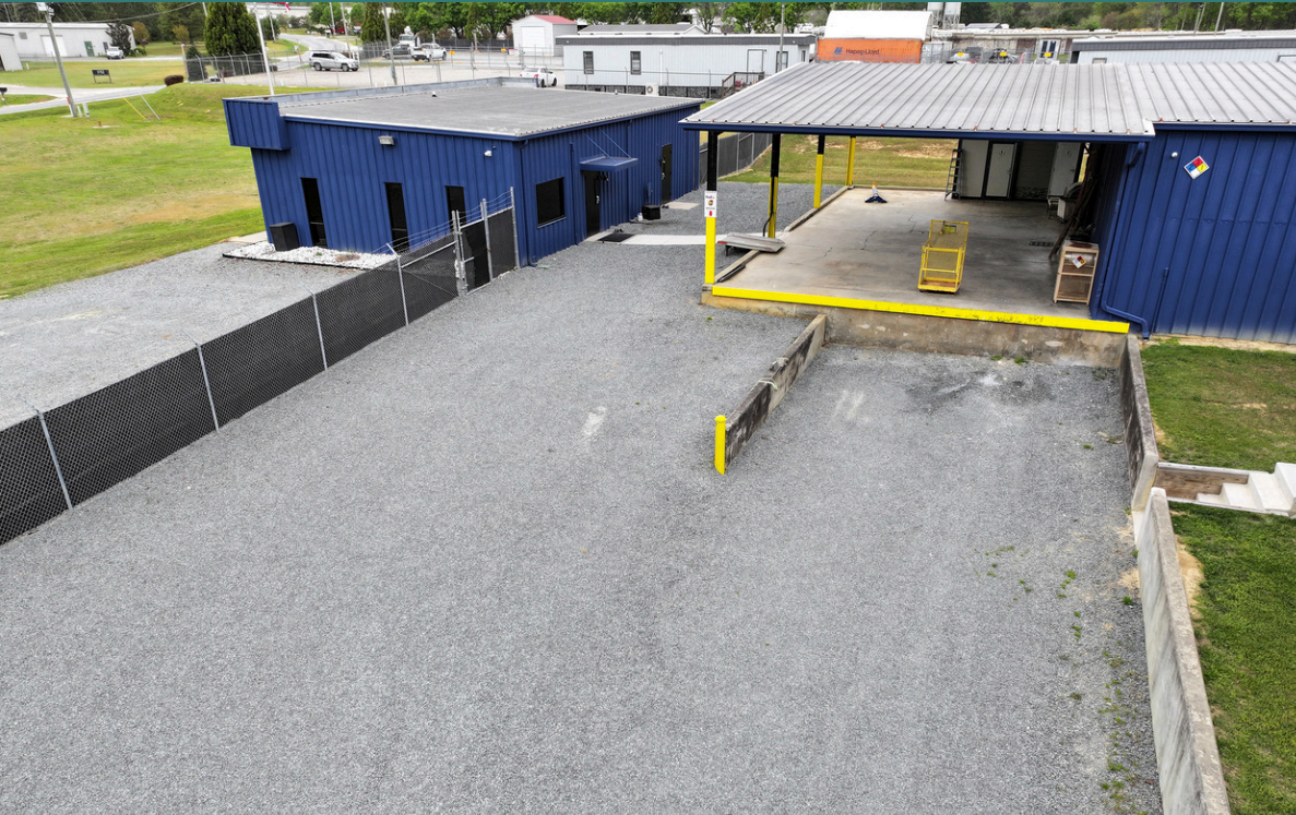
Dock Access & Office Building