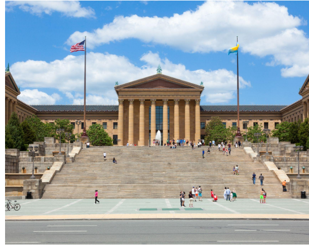
PHILADELPHIA MUSEUM OF ART