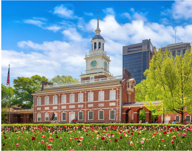
INDEPENDENCE NATIONAL HISTORICAL PARK