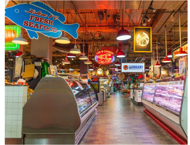
READING TERMINAL MARKET