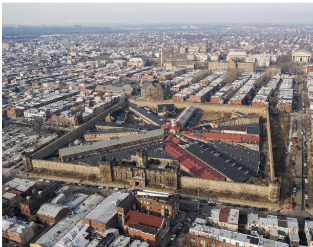
EASTERN STATE PENITENTIARY