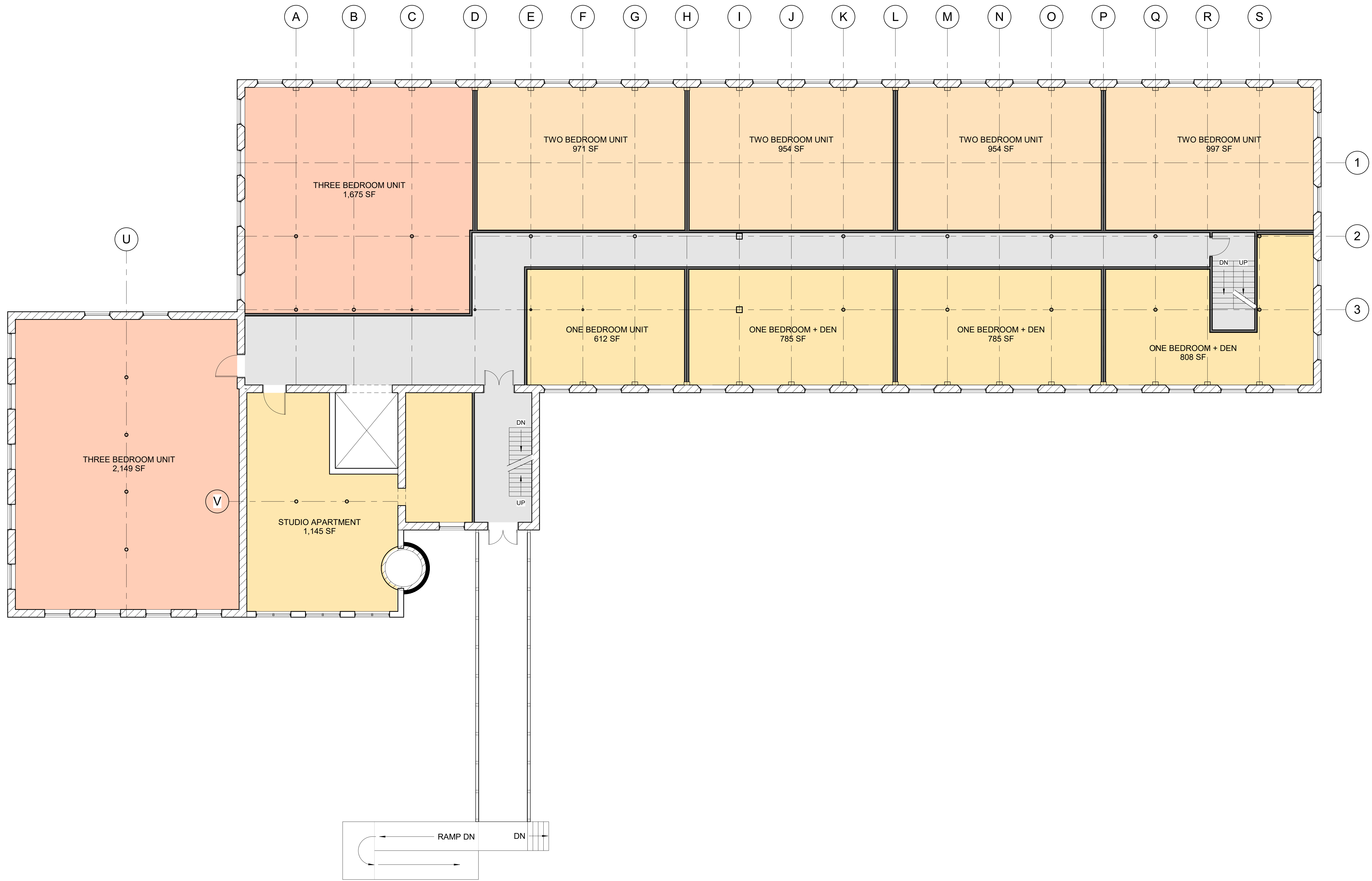
1 | 4TH FLOOR 1/8" = 1'-0"