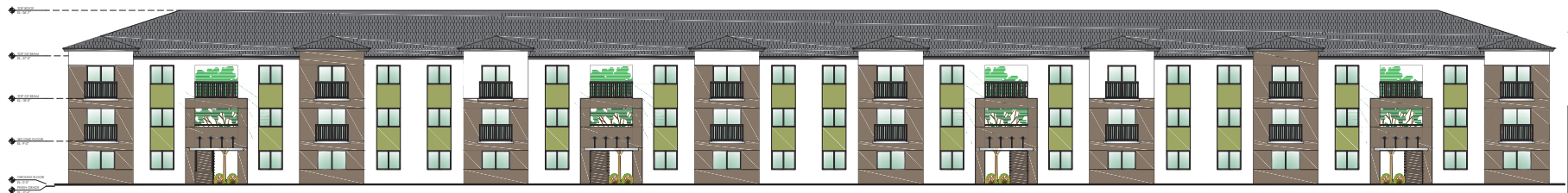
REAR ELEVATION BUILDING TYPE B - BUILDINGS 3 & 5 SCALE: 3/32" = 1'-0"

AMC PARK - SOUTH DADE - Site Plan Review OWNER: AMC DEVELOPMENT GROUP, LLC ADDRESS: 12601 SW 236 ST FOLIO: 30-06924-000-0800