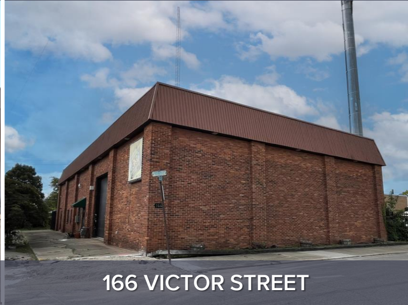
166 VICTOR STREET