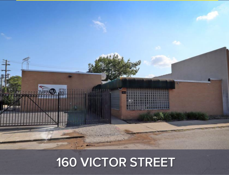
160 VICTOR STREET

SIGNATURE ASSOCIATES KNOW SIGNATURE | KNOW RESULTS