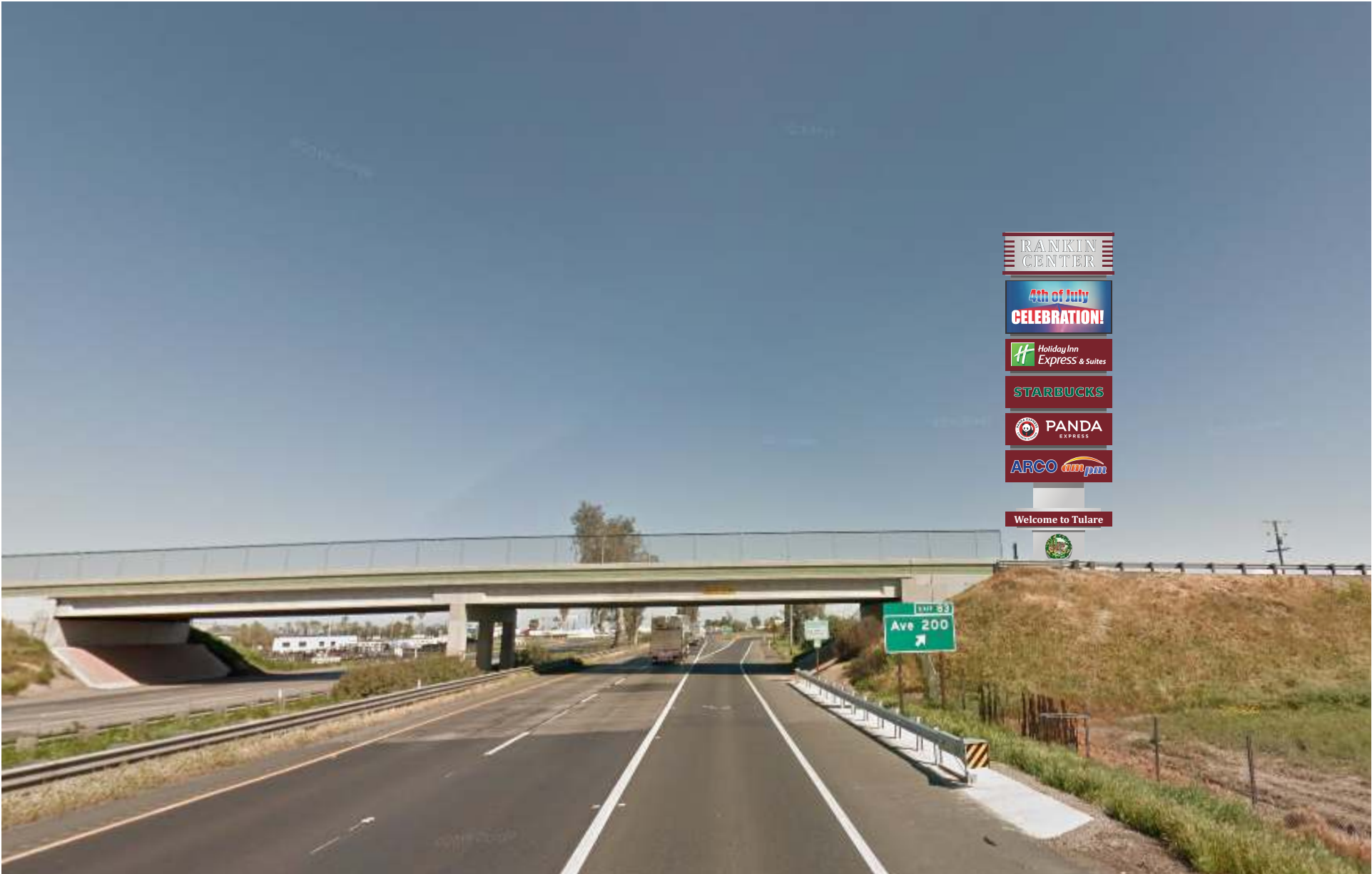
2 NORTH BOND ON HIGHWAY 99 SCALE: NTS