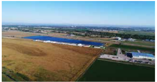
Developments near this property.