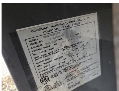
9.1 Item 2 (Picture)