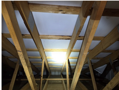
3.1 Item 5 (Picture)