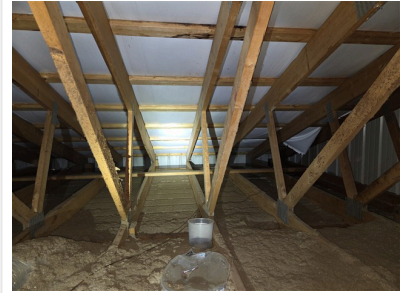
3.1 Item 3 (Picture)