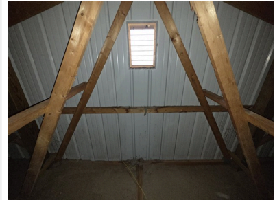
3.1 Item 6 (Picture)