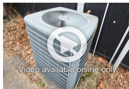
9.1 Item 3 (Video)

This concludes the report summary. The video and summary are provided as a courtesy and do not override the written report. Only written statements in the report may be relied upon as the inspectors final recommendations. Please read the report in it's entirety.