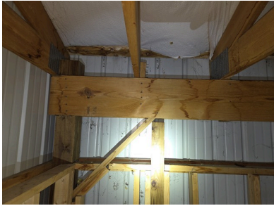
3.1 Item 1 (Picture)