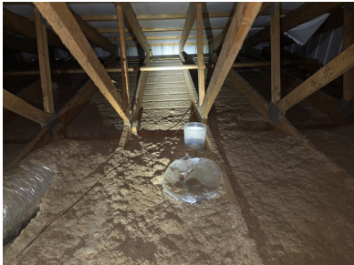
3.1 Item 4 (Picture)