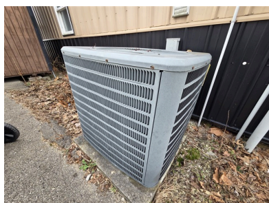
9.1 Item 1 (Picture)