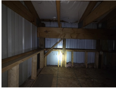
3.1 Item 2 (Picture)