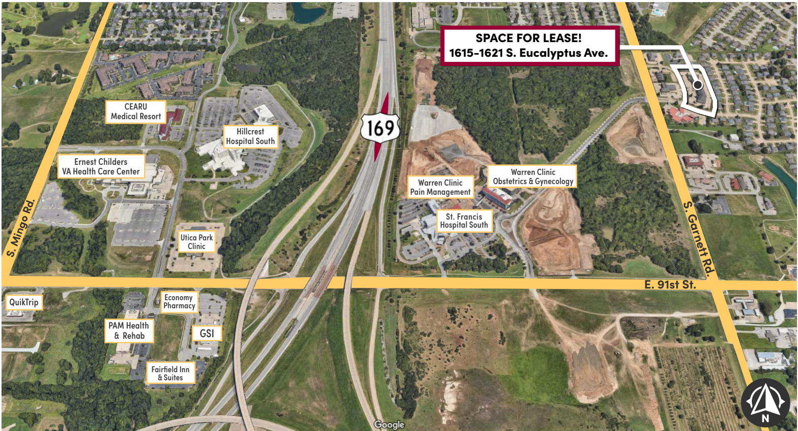
Greater Tulsa Area Map