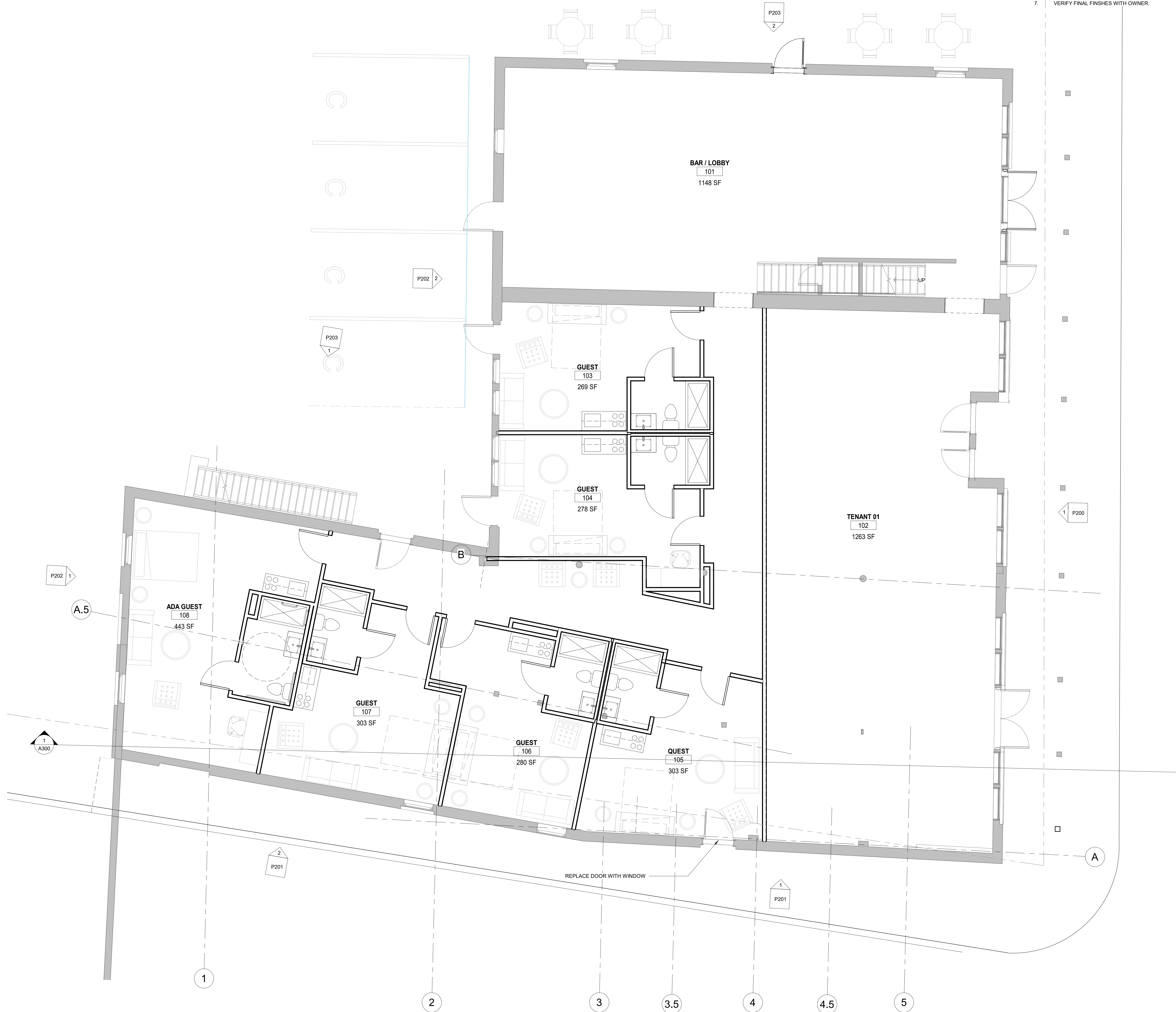
1 FLOOR PLAN - LEVEL 1 1/4" = 1'-0"