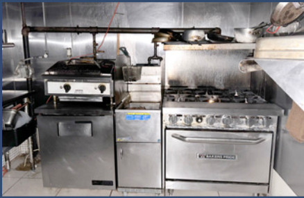
BUILT-OUT KITCHEN W/VENTILATION