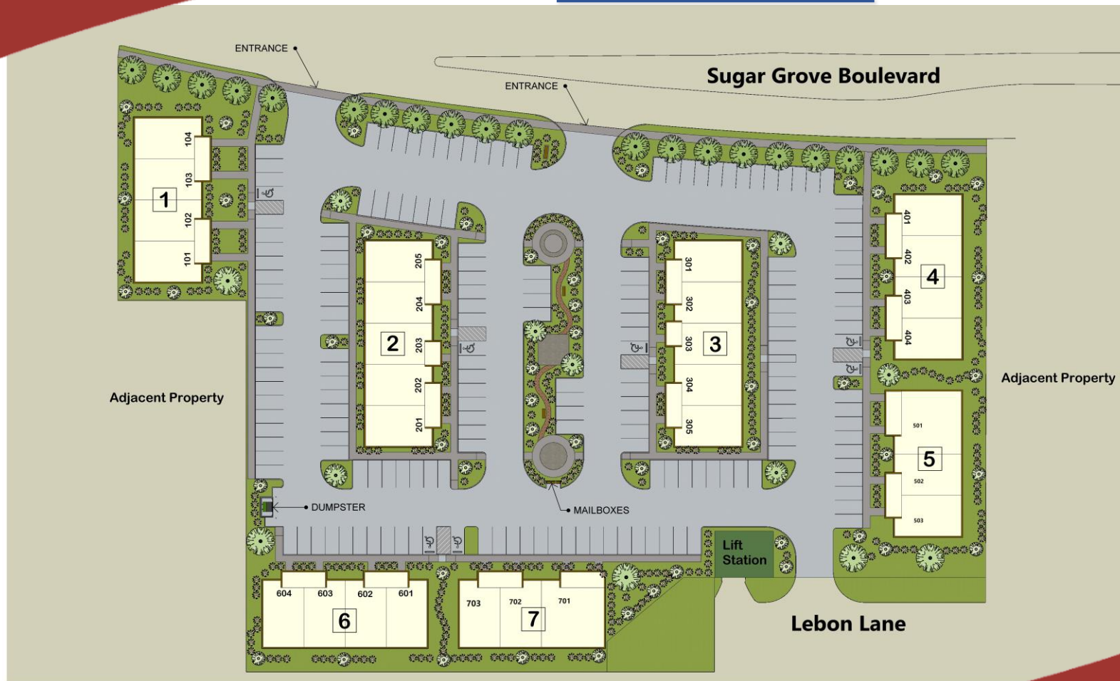
Sugar Grove Office Condominiums