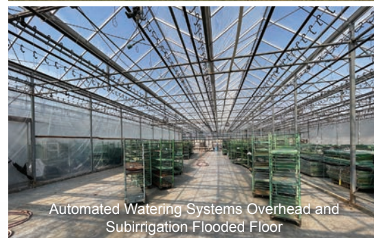
Automated Watering Systems Overhead and Subirrigation Flooded Floor