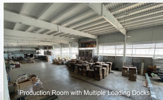
Production Room with Multiple Loading Docks