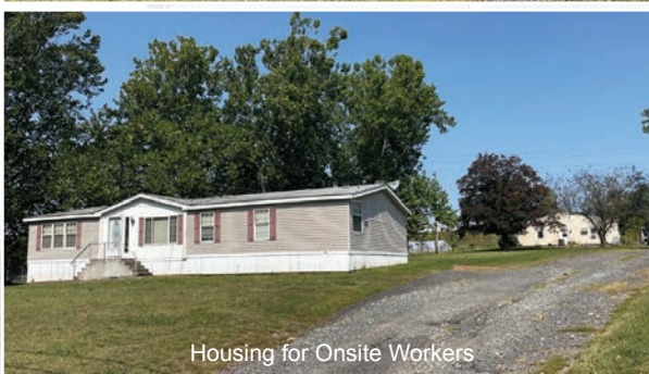
Housing for Onsite Workers