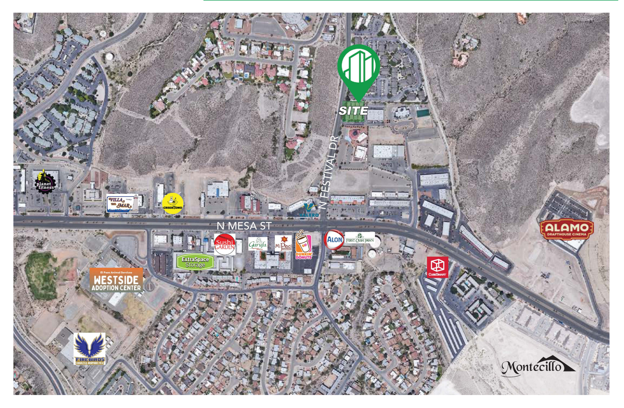
The information contained herein was obtained from sources deemed reliable; however, RESOLUT RE makes no guaranties, warranties or representations to the completeness or accuracy thereof. The presentation of this real estate information is subject to errors; omissions; change of price; prior sale or lease; or withdrawal without notice. RESOLUT RE, which provides real estate brokerage services, is a division of Reliance Retail, LLC, a Texas Limited Liability Company.