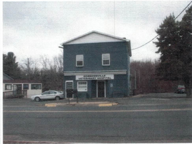
Main Structure Photo