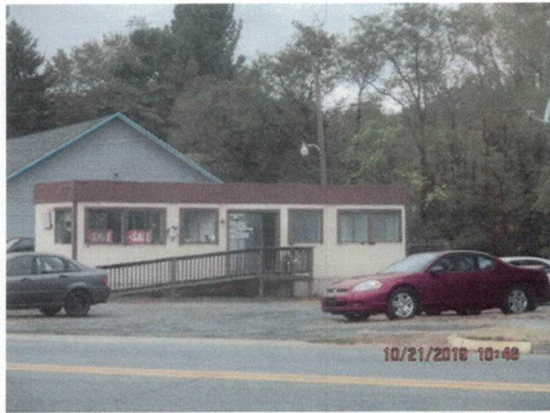
Main Structure Photo