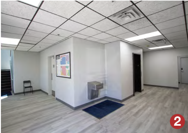
Main level - Suite 110: 1,900 SF