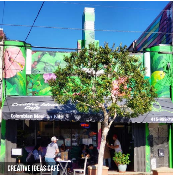
CREATIVE IDEAS CAFE