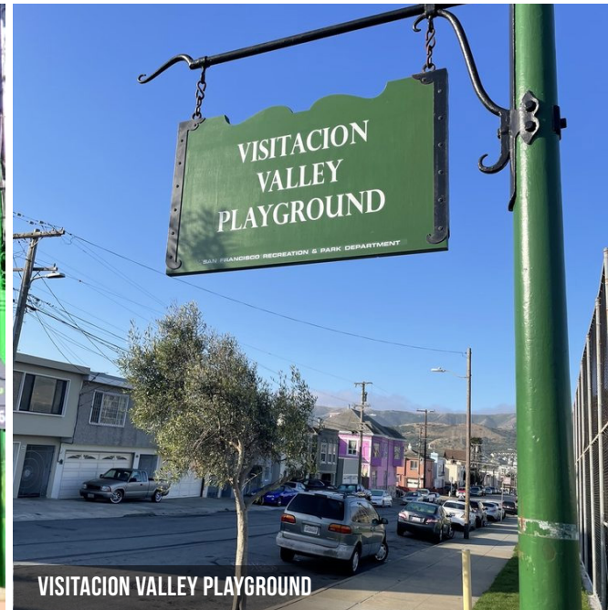
VISITACION VALLEY PLAYGROUND