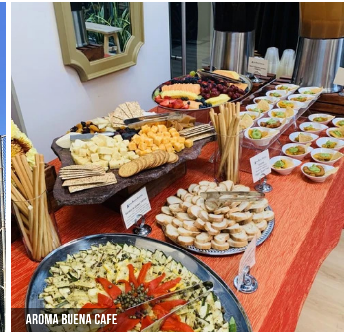
AROMA BUENA CAFE