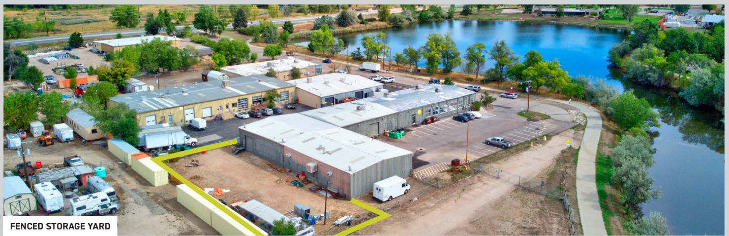
FENCED STORAGE YARD