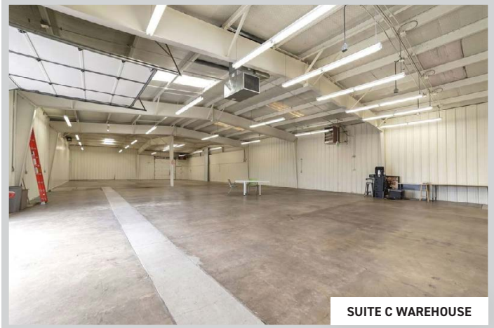
SUITE C WAREHOUSE