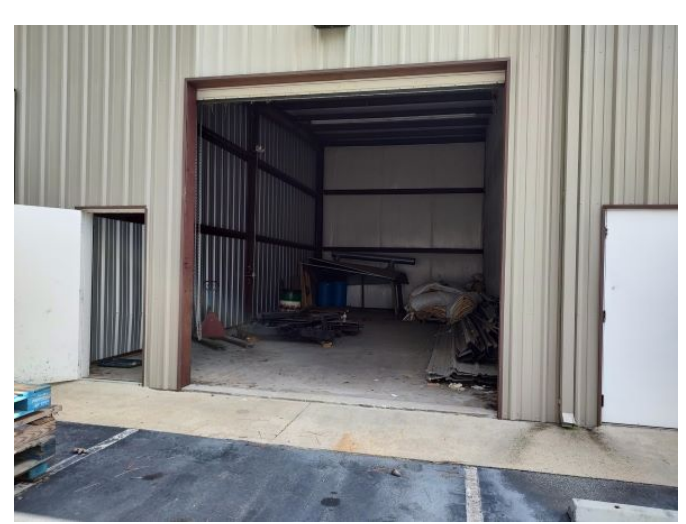
For more information, contact