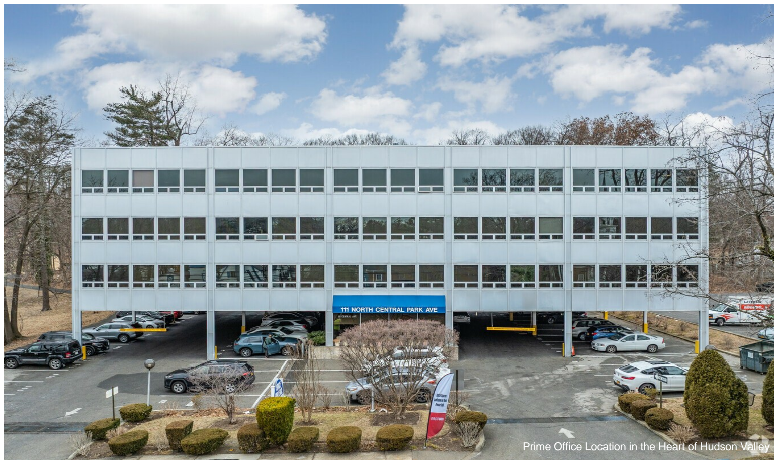
Prime Office Location in the Heart of Hudson Valley