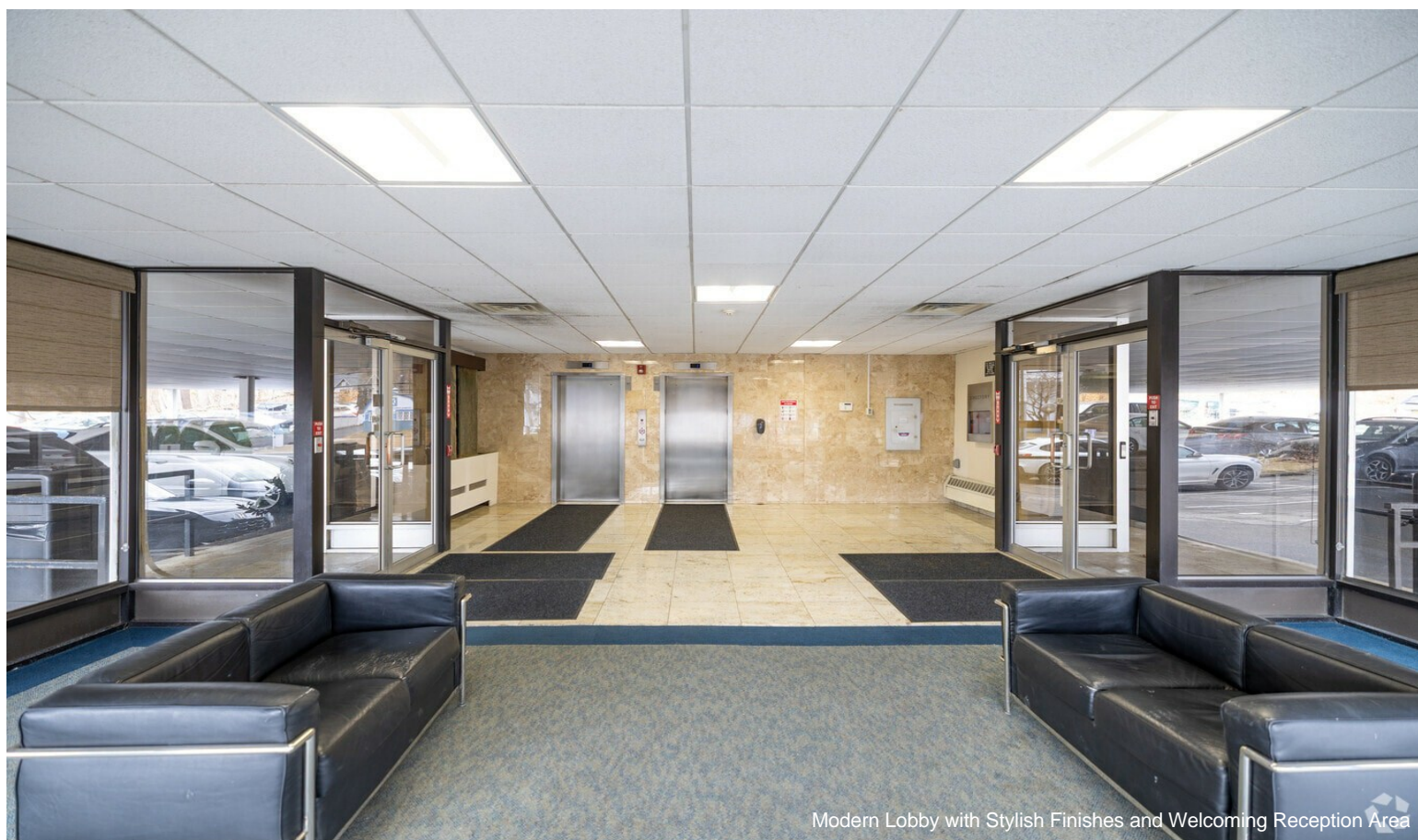
Modern Lobby with Stylish Finishes and Welcoming Reception Area