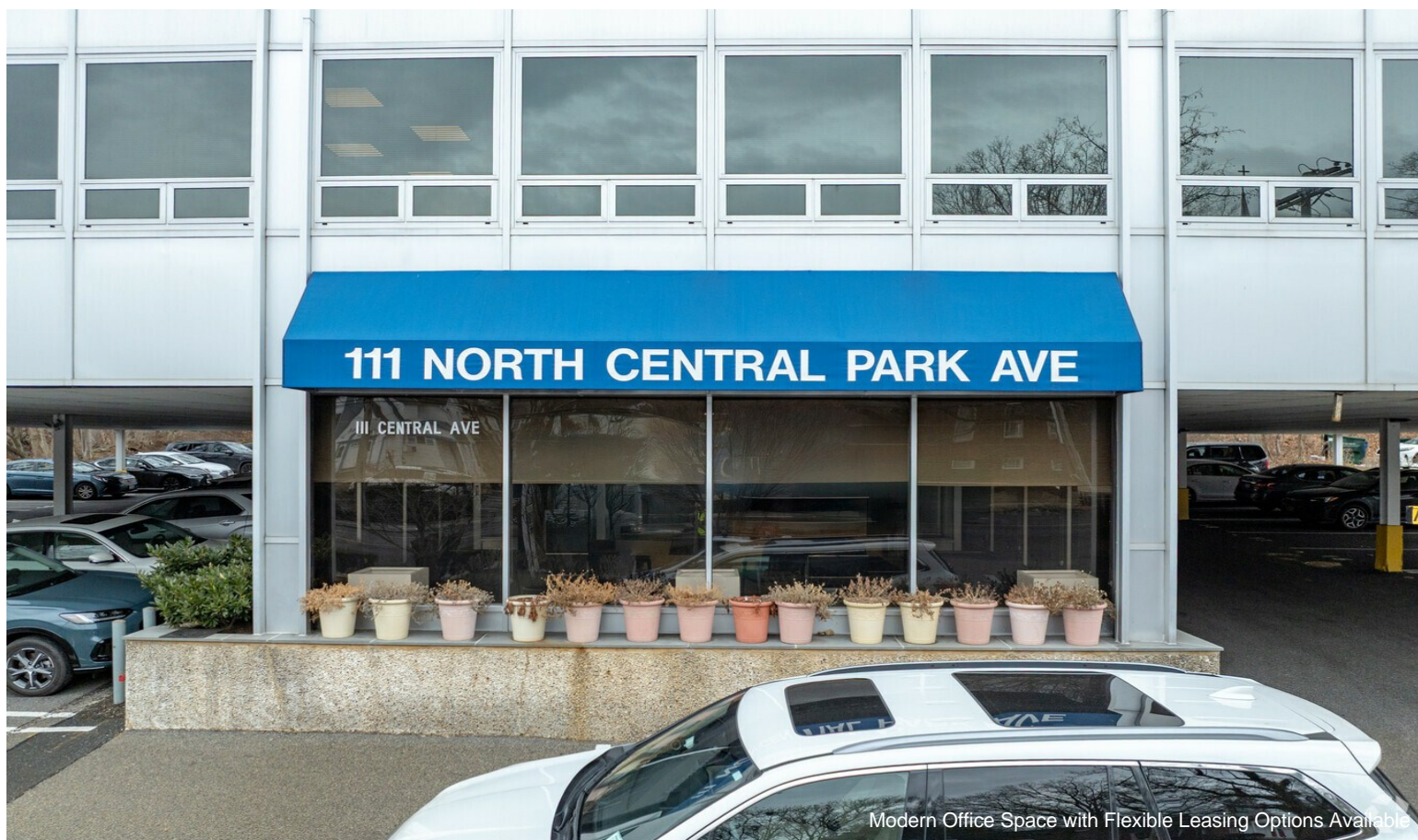
Modern Office Space with Flexible Leasing Options Available