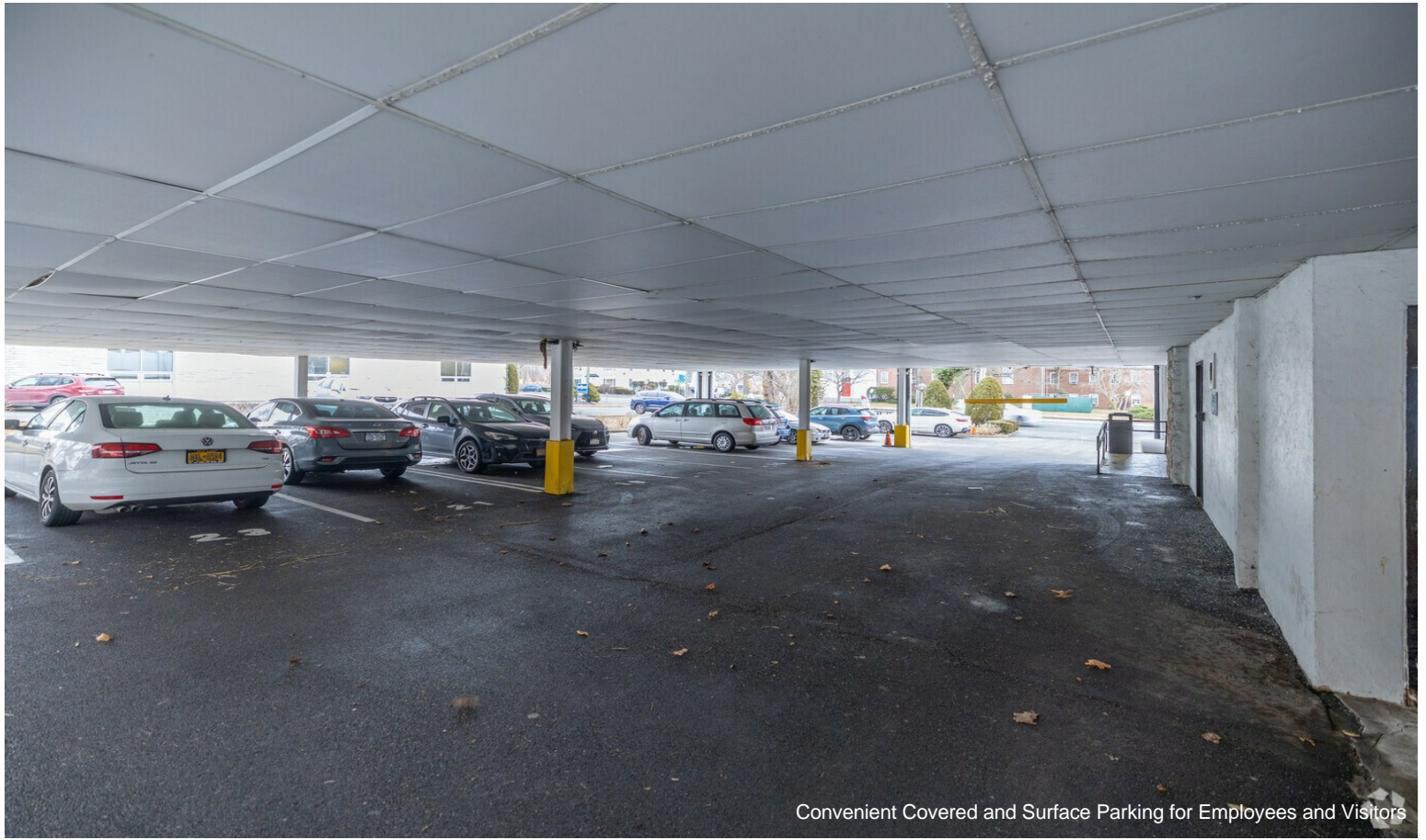
Convenient Covered and Surface Parking for Employees and Visitors