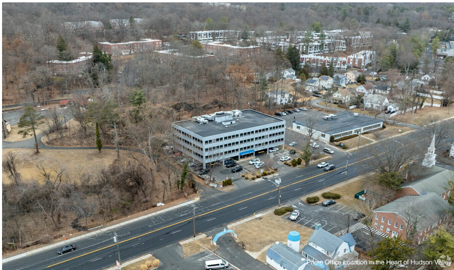
Prime Office Location in the Heart of Hudson Valley