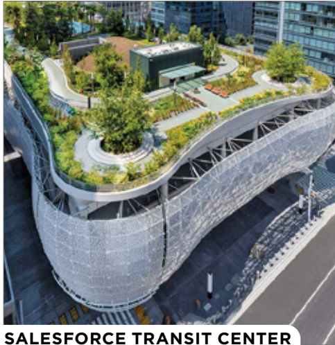
SALESFORCE TRANSIT CENTER