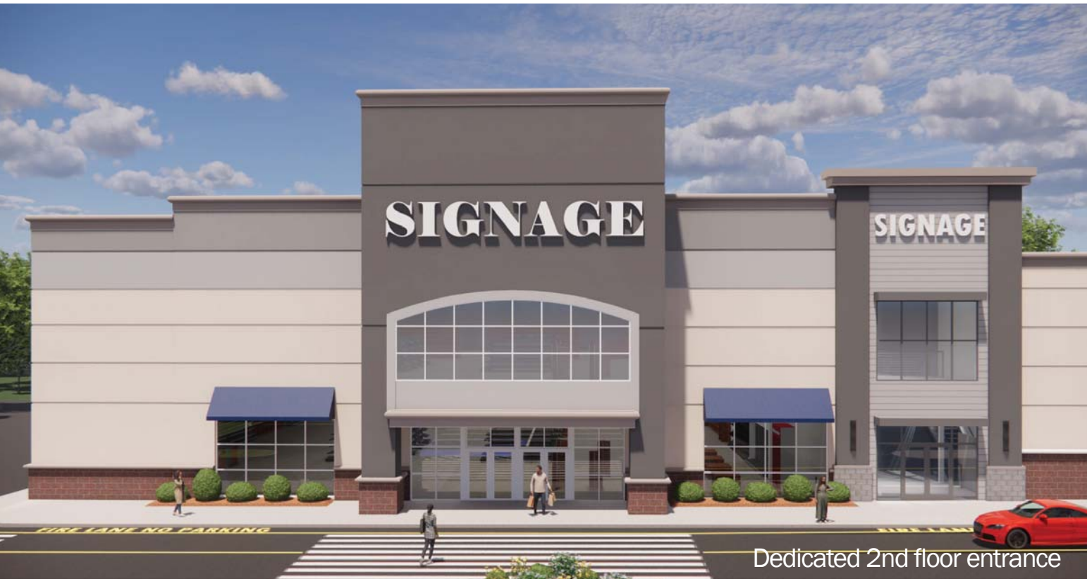
Dedicated 2nd floor entrance