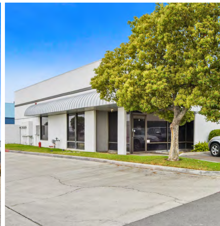
1188 N GROVE ST, ANAHEIM, CA