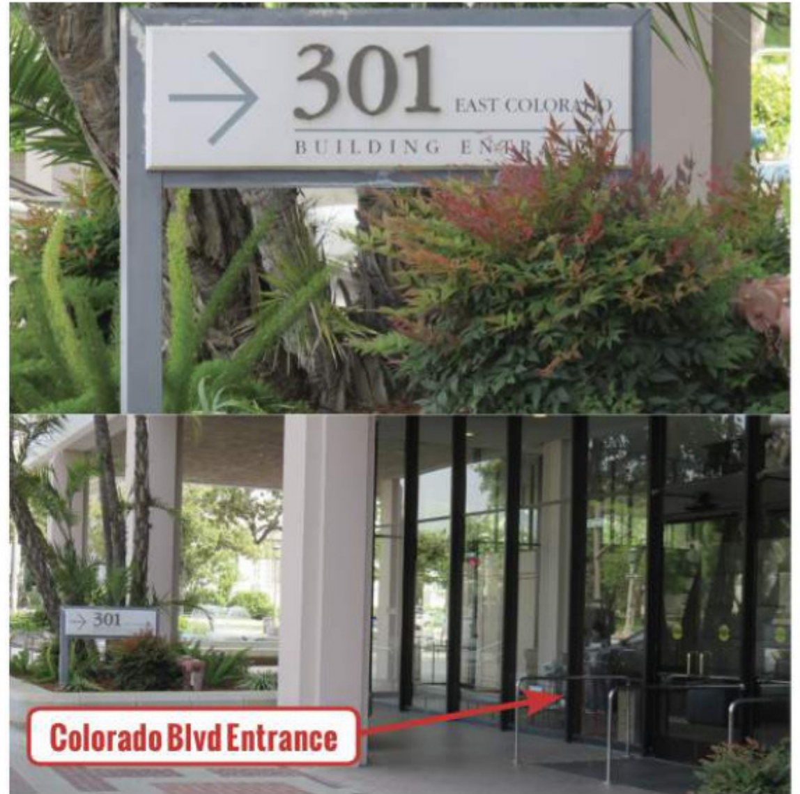
Colorado Blvd Entrance