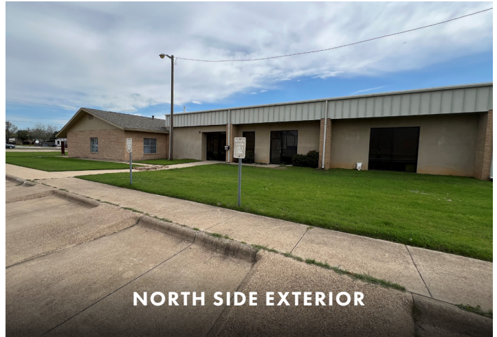
NORTH SIDE EXTERIOR