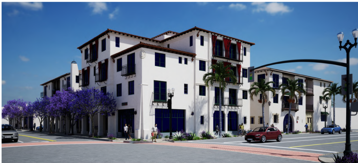
Ortega and Chapala Streets