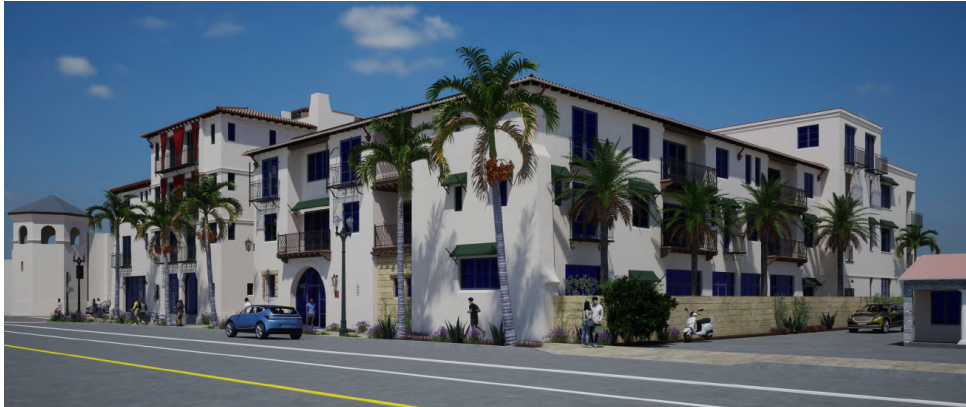
Up Chapala Street