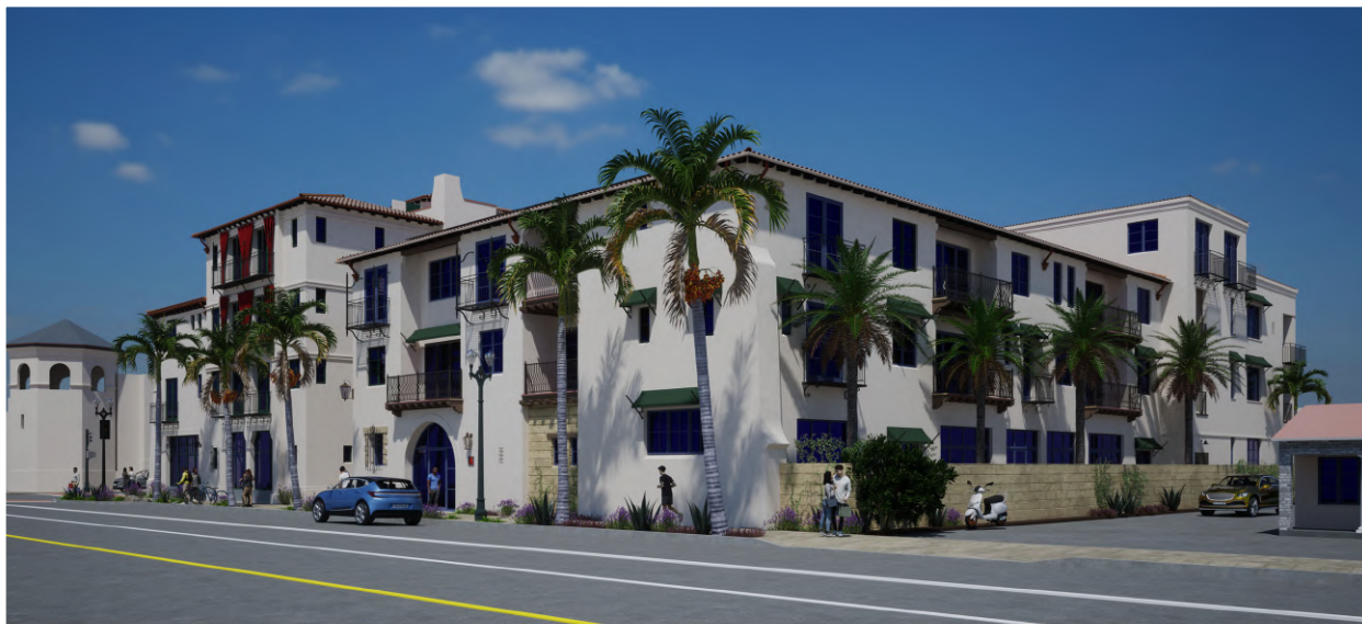
Up Chapala Street