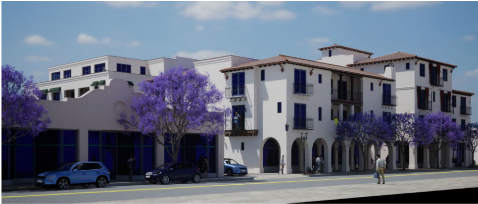
Ortega Street from Macy's Entrance