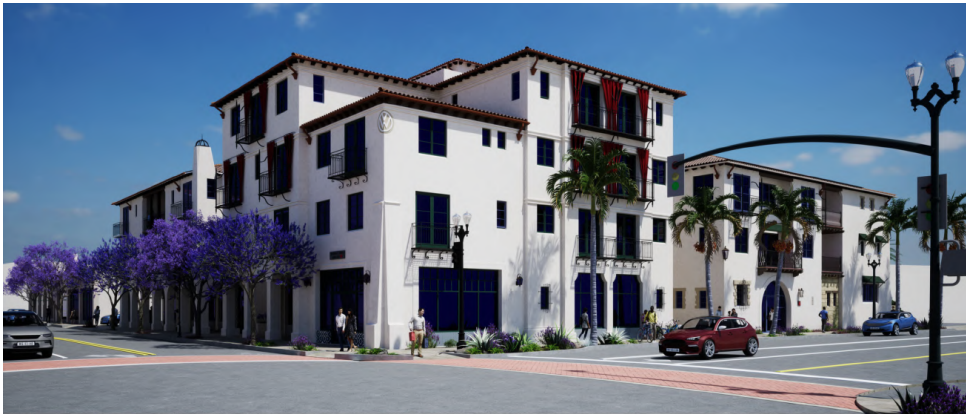
Ortega and Chapala Streets