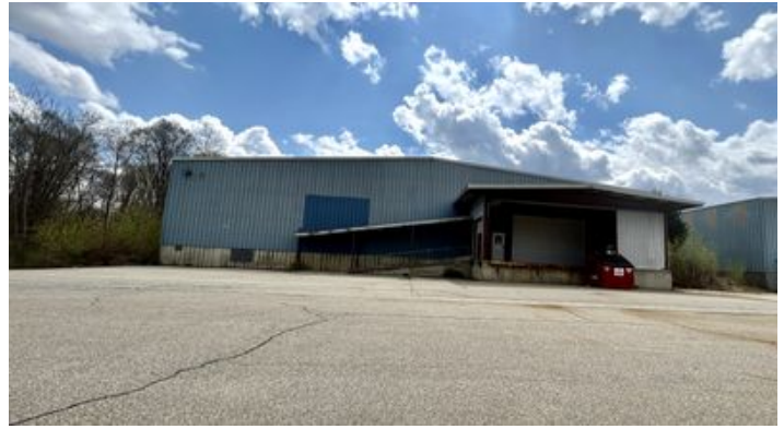
Dock with cold storage space