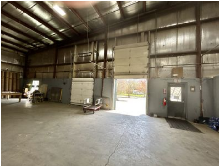
2 docks - 12,000 SF heated spce