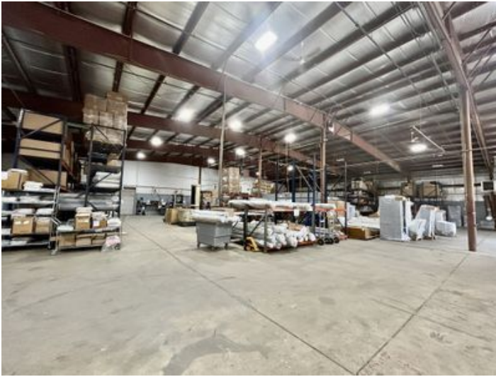
17' - 21' height