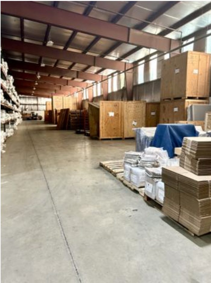
Cold storage along sides - 8000 SF