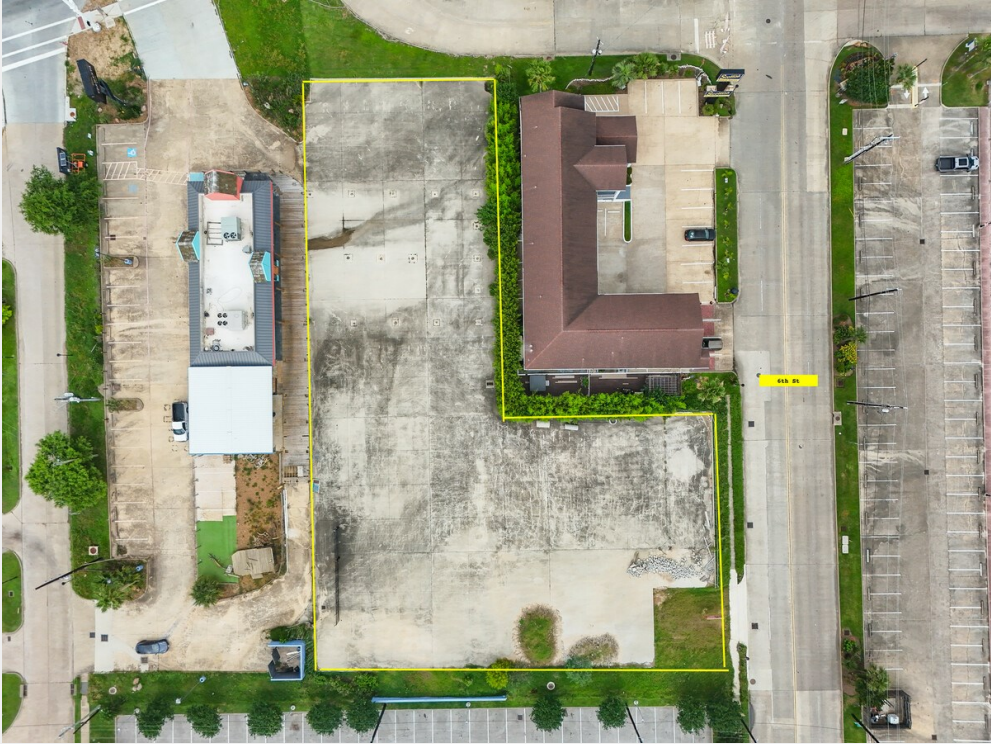
1.0215 acres of unrestricted, concrete paved property