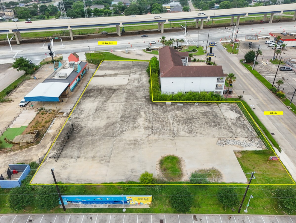
Hotel available flags with Marriott & IHG Hotel