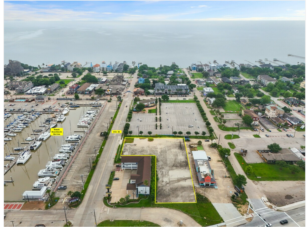
Situated next to the Kemah Boardwalk Marina