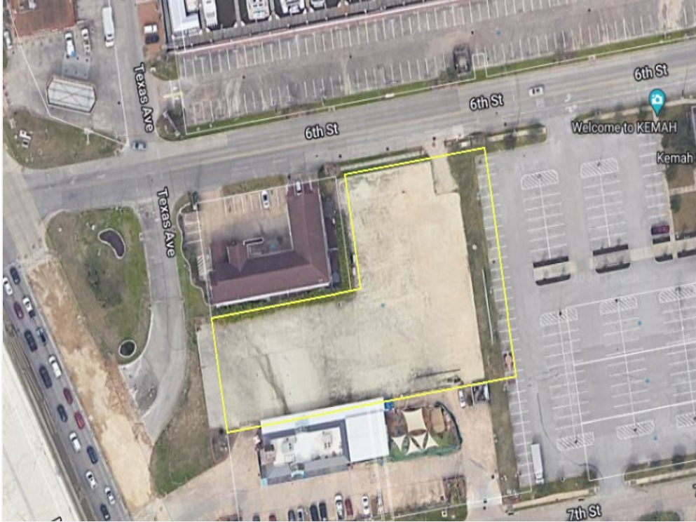
100 feet of frontage on N Hwy 146