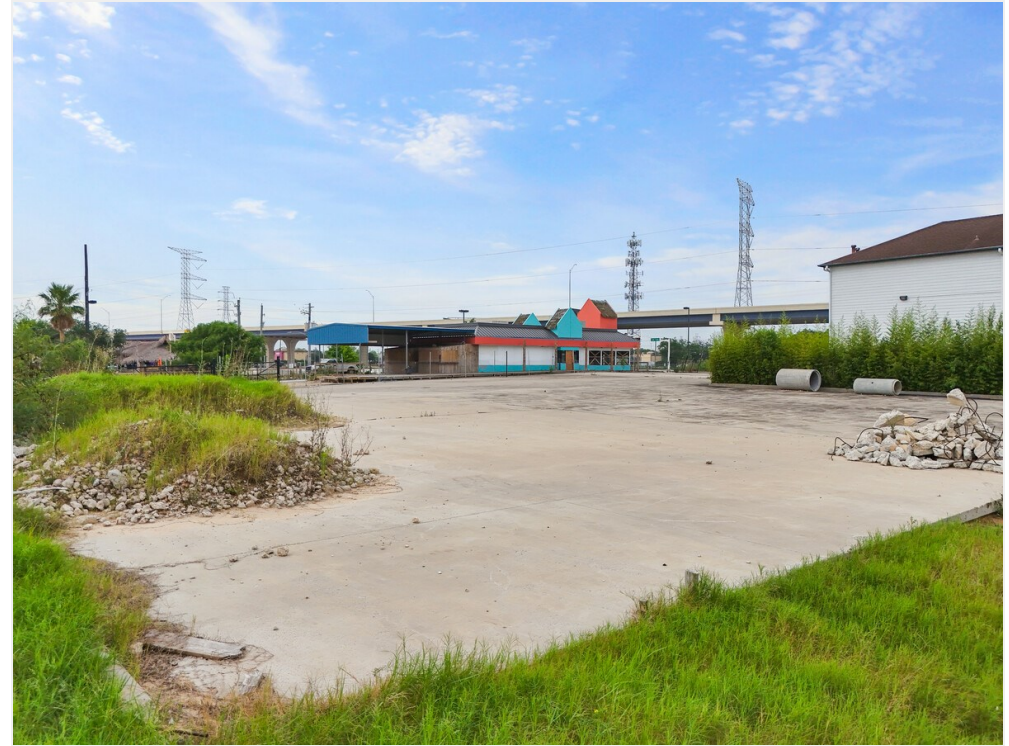
View towards Hwy 146