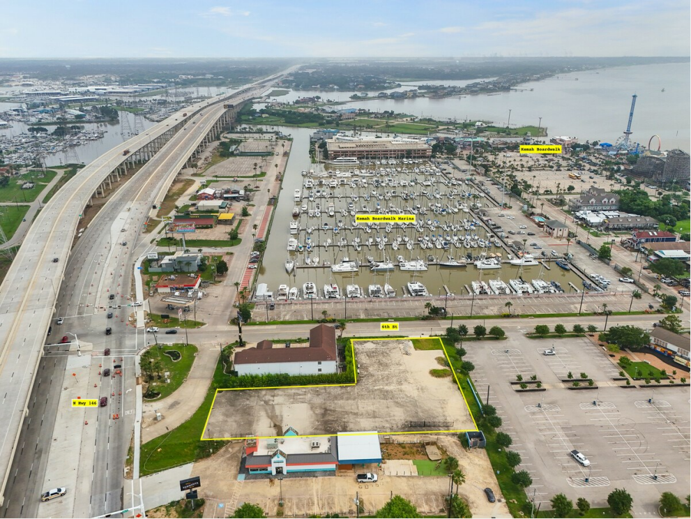
Adjacent Kemah Marina