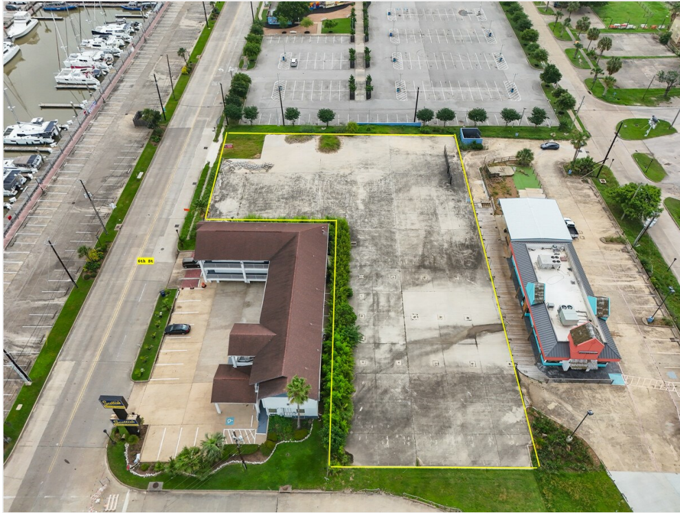
Ideal for restaurants, hotels, multi-use