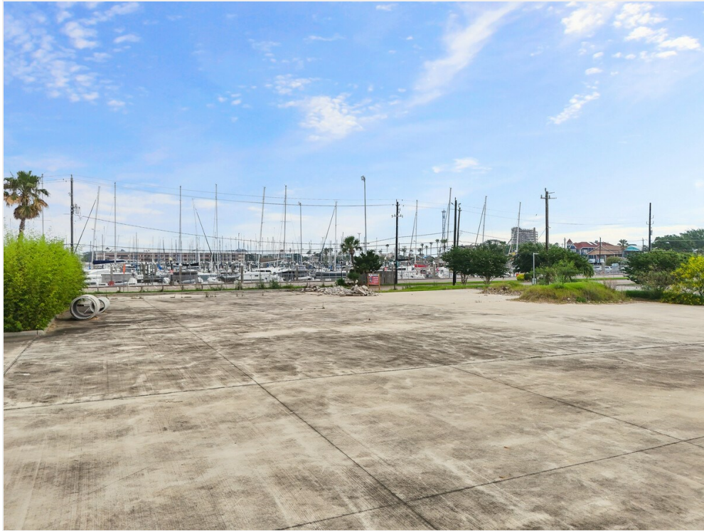
View to the marina