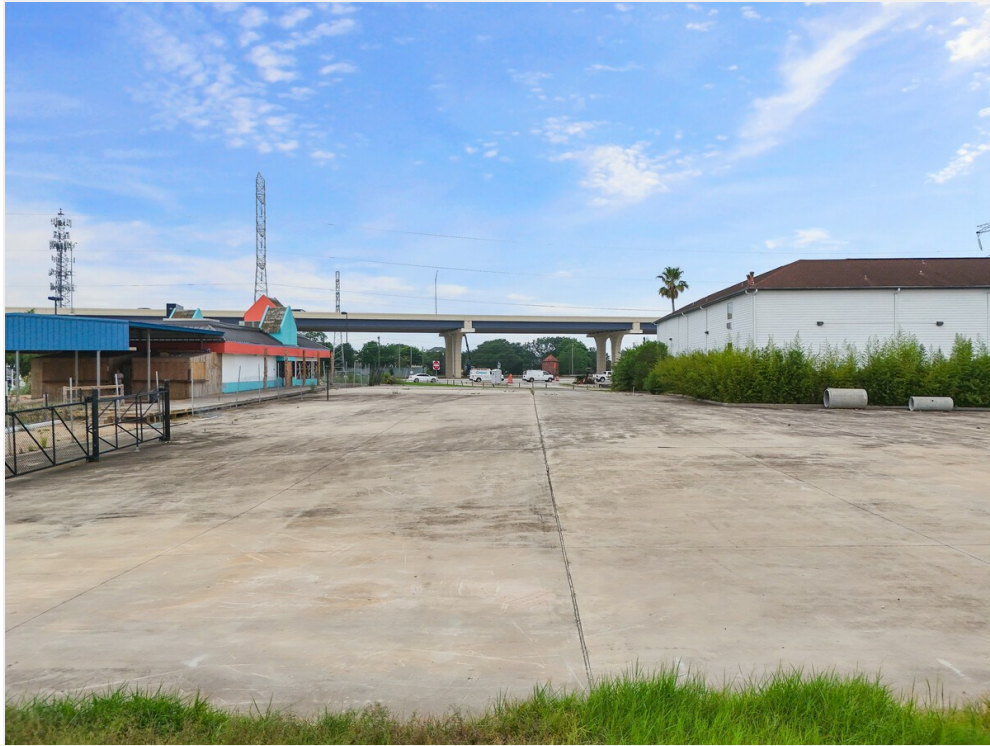
View towards Hwy 146