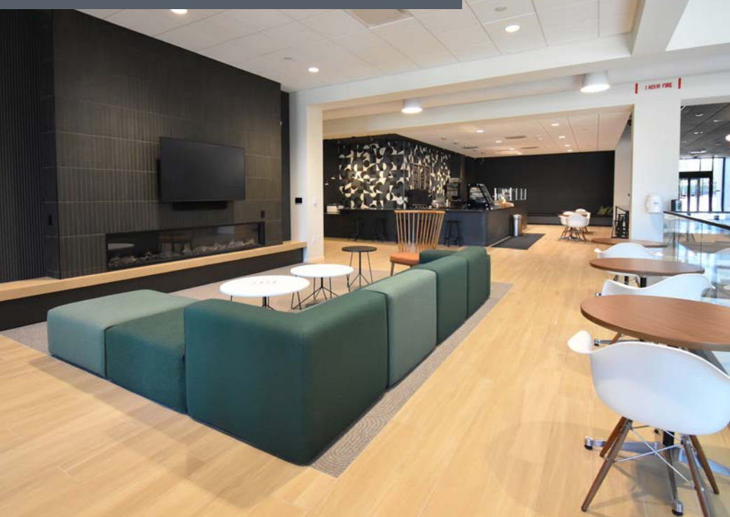
First Floor Lounge and Coffee Bar