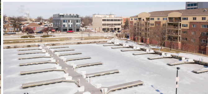
View of Harbor