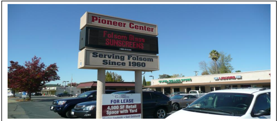
Lighted Marquee Sign for Tenants