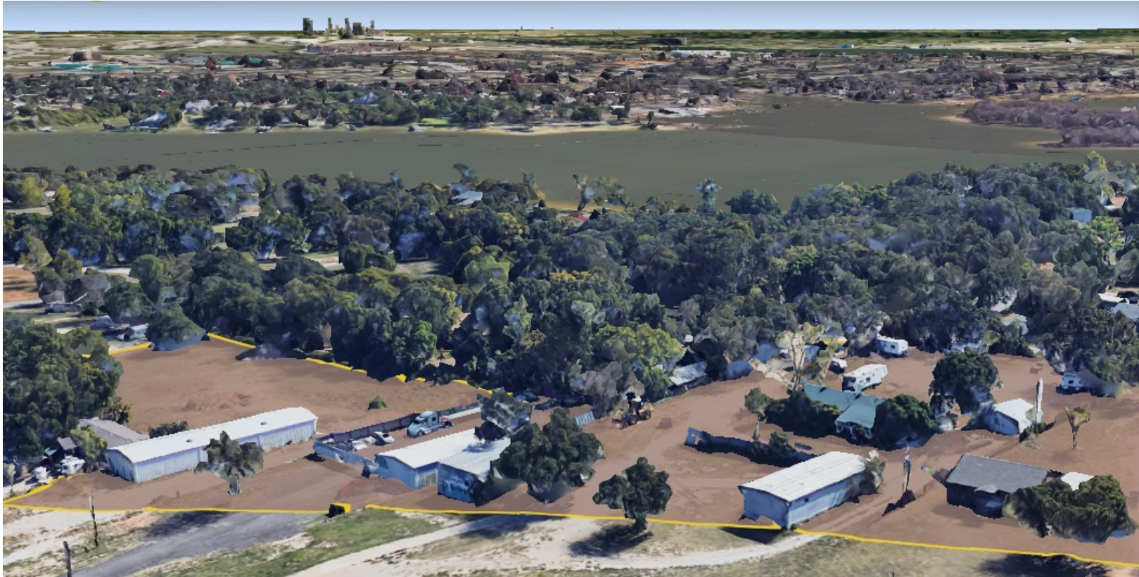
7621 Jacksboro Highway